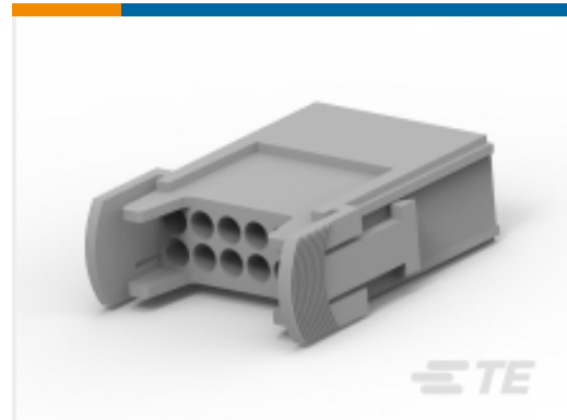
TE Part #T2111122101-000 HMN-012-M