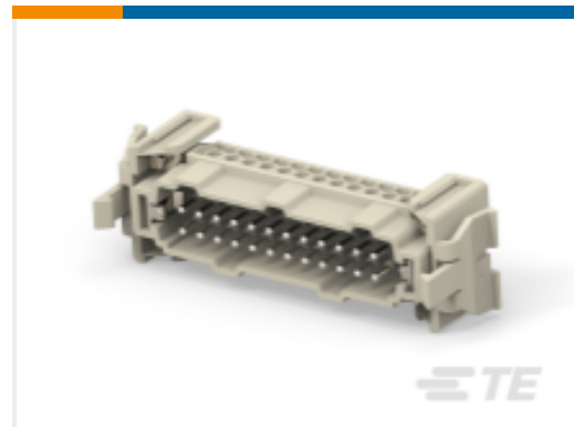
TE Part #T1871002101-000 HB-LM-TOP