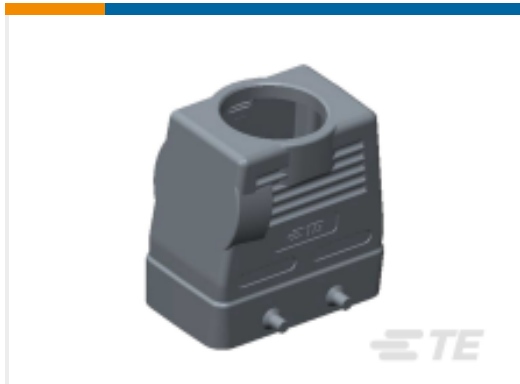
TE Part #T1240100129-000 H10B-TGH-PG29