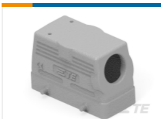
TE Part #T1210160121-200 H16B-TS-PG21