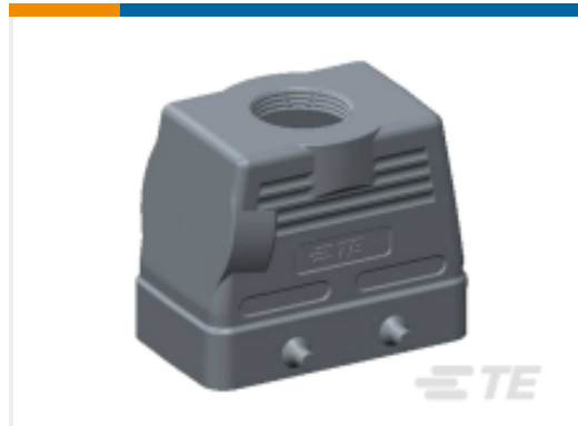
TE Part #T1220100125-000 H10B-TG-M25