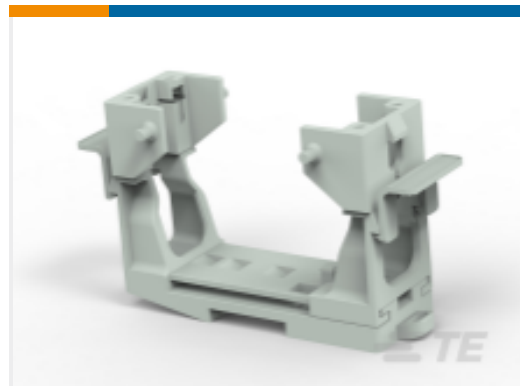
TE Part #T1870002201-000 HB-RAIL-BASE