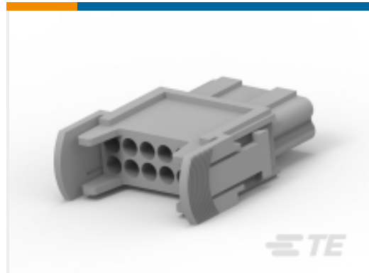
TE Part #T2111122201-000 HMN-012-F