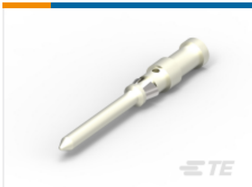
TE Part #T2020001010-000 CDM-1.0