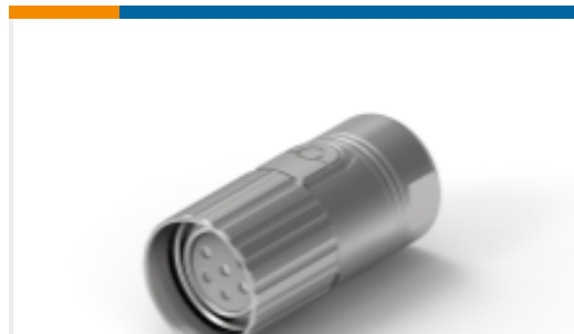
TE Part #ASA151N00410235000 623 PLUG