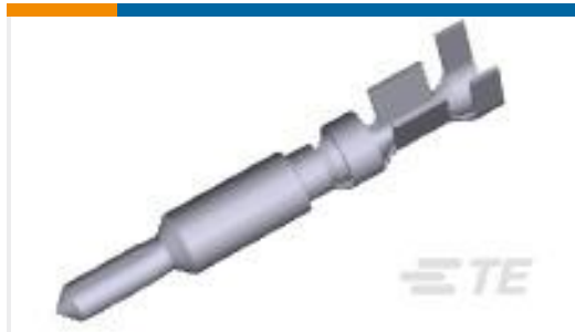
TE Part #1-770250-0 UMNL II PIN SN/AUNI/BR LP20-14