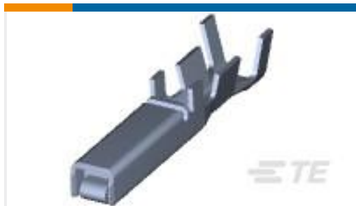
TE Part #175196-3 DYNAMIC D-3 REC CONT/L AU 0.76