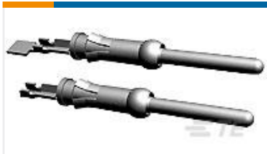
TE Part #1-66359-0 III+ PIN,18-14,30AU/FL,STRIP