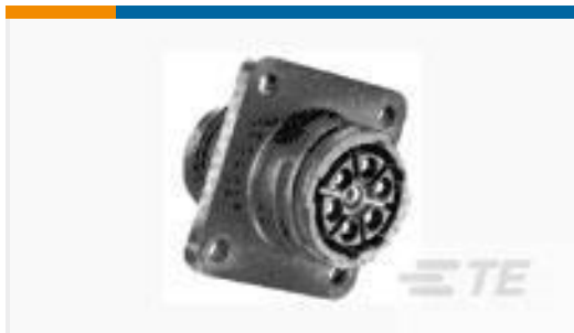
TE Part #211769-2 17-9 CPC RECEPT REV SEX