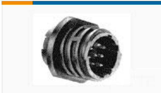
TE Part #206705-4 CPC RECEPT ASSEMBLY SIZE 13-9