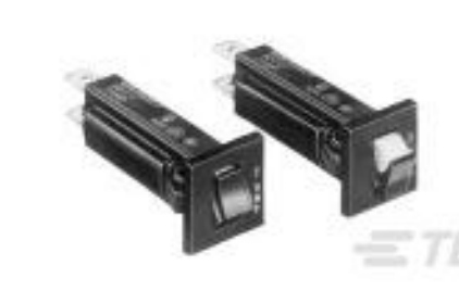
TE Part #1-1393250-7 W28-XQAT-15=W28