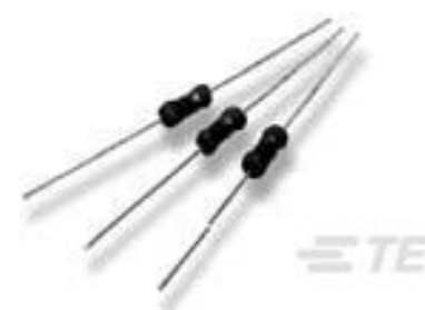
TE Part #4-1879350-2 RR01 5% 11R AMMO