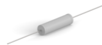
TE Part #4-2176414-8 7W STD M/OX 5% 1K8