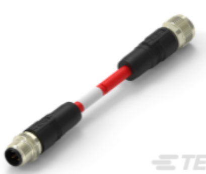
TE Part #TAA545B1411-060 M12A4-MS-FS-PVC-6.0M