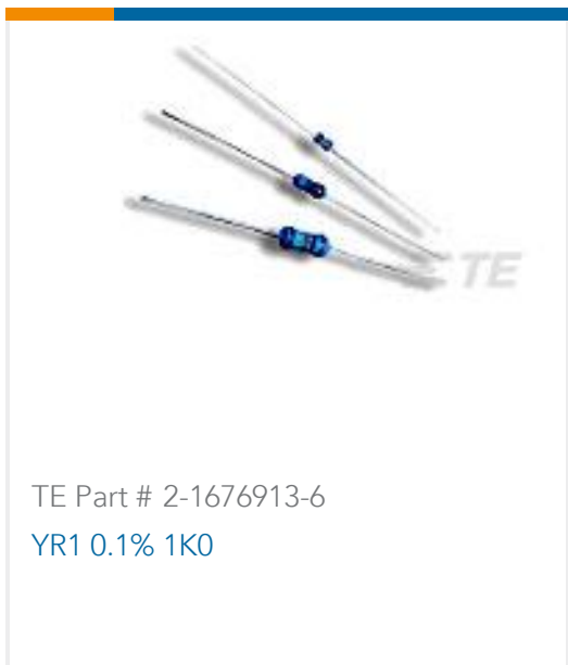
TE Part # 2-1676913-6 YR1 0.1% 1K0