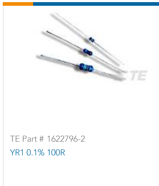
TE Part # 1622796-2 YR1 0.1% 100R