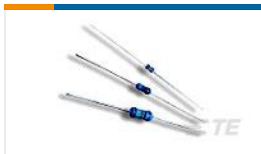
TE Part #9-1879026-0 YR1 0.1% 49R9