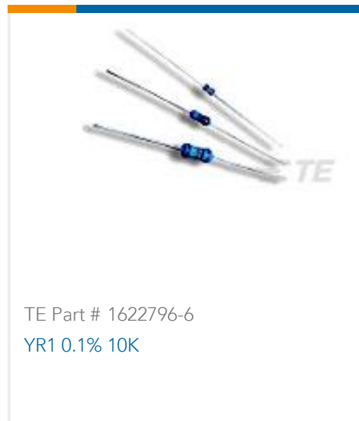
TE Part # 1622796-6 YR1 0.1% 10K