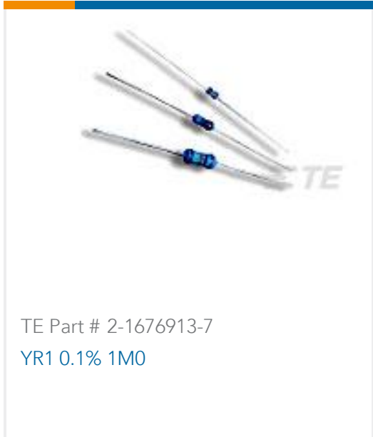
TE Part # 2-1676913-7 YR1 0.1% 1M0