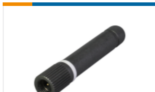
TE Part #ANT-868-CW-RH-SMA Antenna 1/4 Wave Short 868MHz SMA