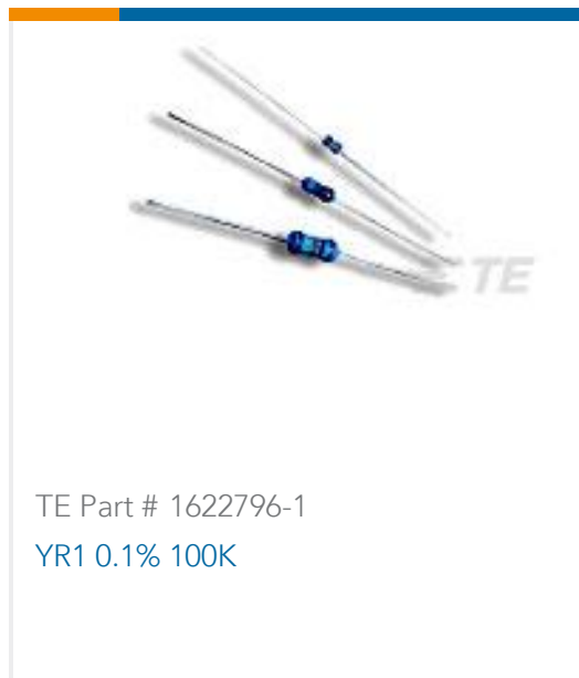
TE Part # 1622796-1 YR1 0.1% 100K