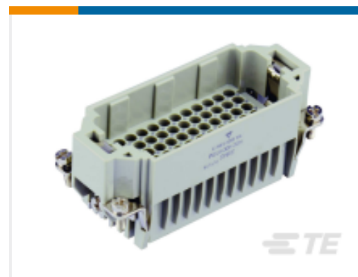
TE Part #T2030722101-000 HDD-072-M