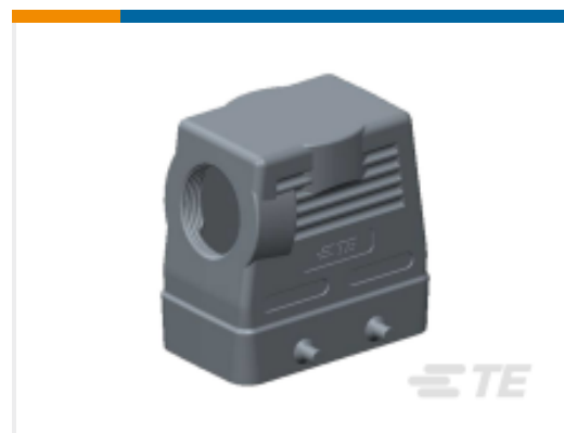
TE Part #T1230160140-000 H16B-TSH-M40