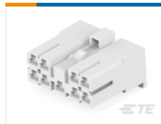
TE Part #171892-1 9CIR MIC PLUG HSG