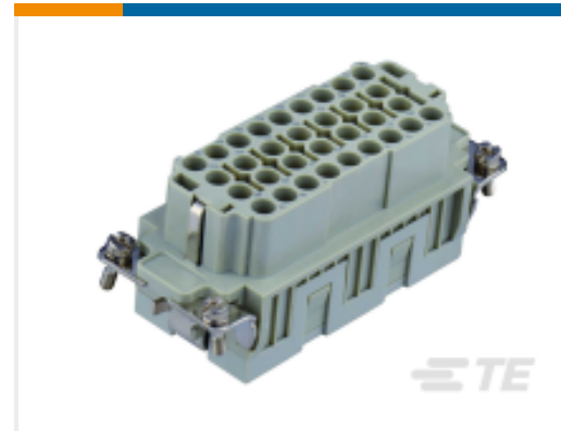
TE Part #T2050322201-000 HEE-032-F