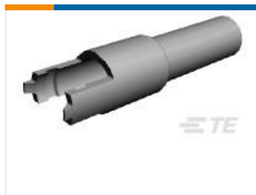
TE Part #1-480351-0 01P CMNL CAP HSG NATL