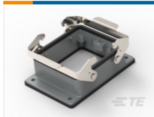
TE Part #T1410322000-000 H32B-AG