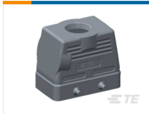
TE Part #T1220100125-000 H10B-TG-M25