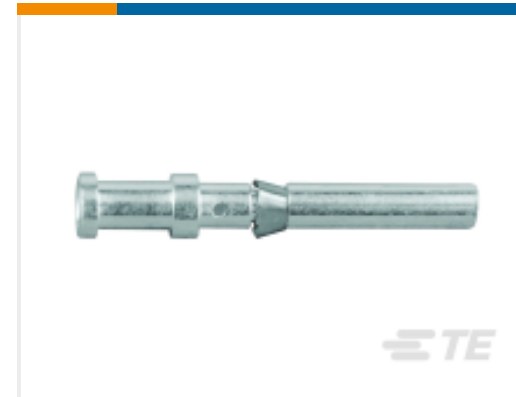
TE Part #T2020002015-000 CDF-1.5