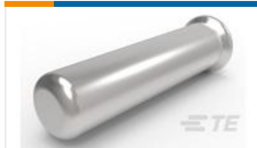
TE Part #50865 SOCKET,MIN-SPR AU SER-4