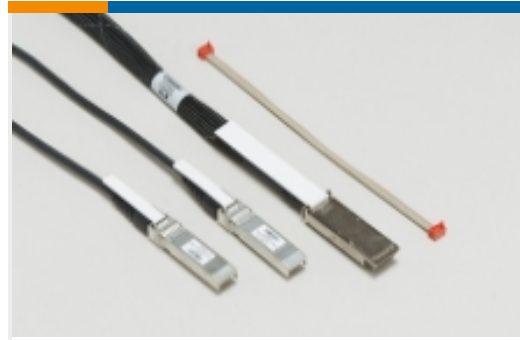
Pluggable I/O Cable Assemblies(78)