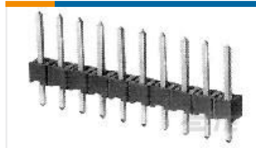
TE Part #826926-3 3P AMPMODU II PIN HDR.