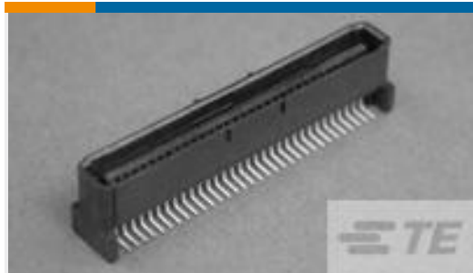
TE Part #120527-1 1FHP,64,30AVP,S,N,S10,12,13,15