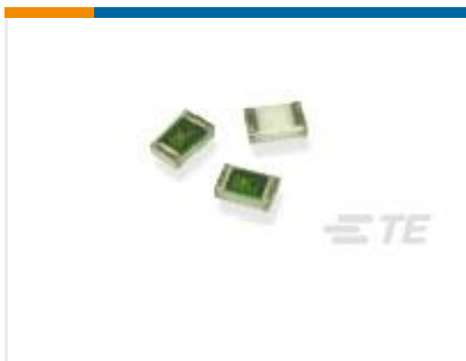
TE Part #7-2176087-0 RP 1J 0.166W 365R 0.1% 25PPM 1K RL