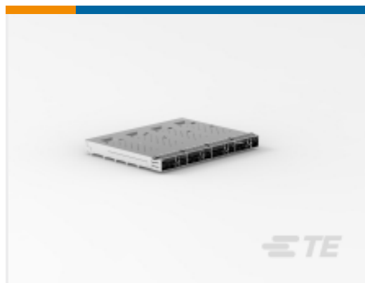
TE Part #2170744-1 CAGE ASSEMBLY, 1X4, QSFP28, SPRING