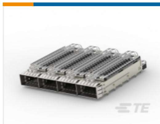
TE Part #2-2170747-4 CAGE ASSY, 1X4, QSFP28, SPRING, HS, LP