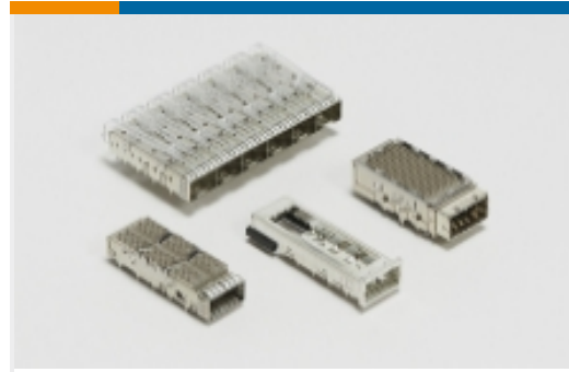
Pluggable IO Connectors & Cages(424)