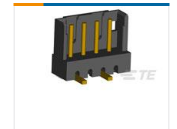
TE Part #292172-3 CT POST HDR ASSY 3P IN-TUBE BL