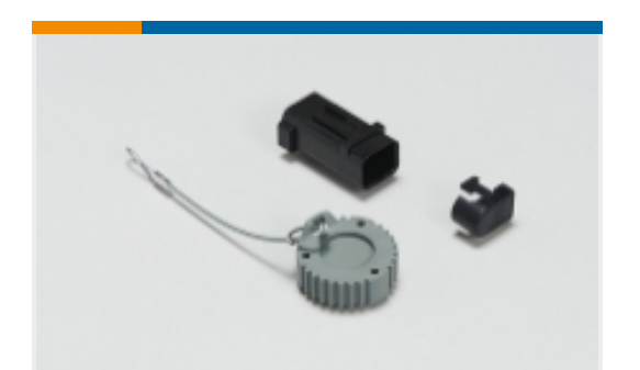
Automotive Connector Caps & Covers (9)