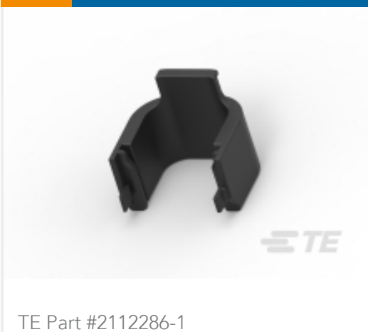
COVER,90,FOR REC. CARRIER 25/36P