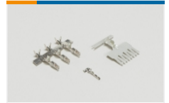
Busbars & Terminals(1)