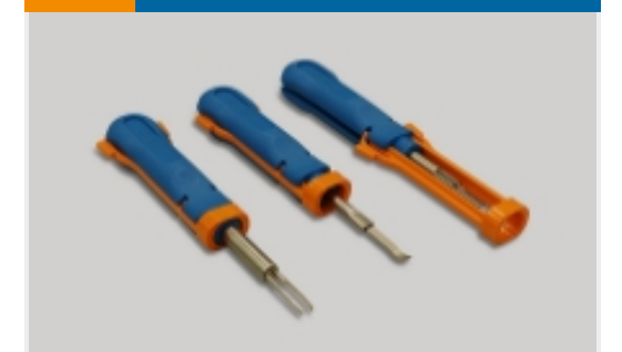
Insertion & Extraction Tools(8)