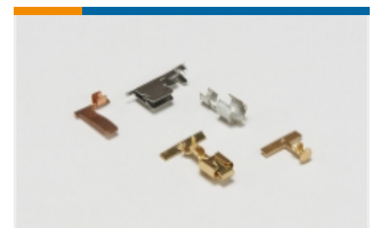
Special Purpose Terminals(2)