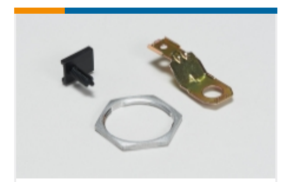
Other Automotive Connector Accessories(2)