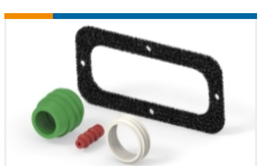
Connector Seals & Cavity Plugs(9)