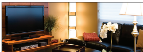
Smart Home (Sound Bars, Thermostats, Fitness Equipment, Vacuums, Beds, Faucets)