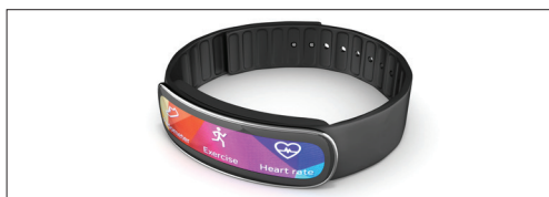
Wearables (Smart Watches, Health Monitors, AR & VR)