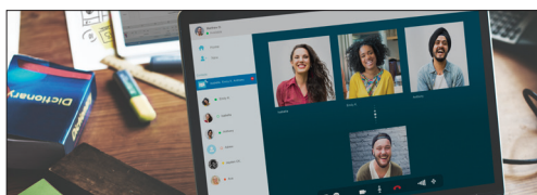
5G Networking/Telecommunications Communication Modules (WiFi Routers and Mesh Devices)