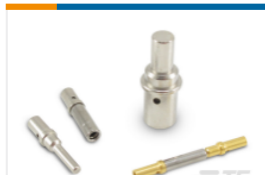
TE Part #0460-202-16141 DEUTSCH Solid Contacts