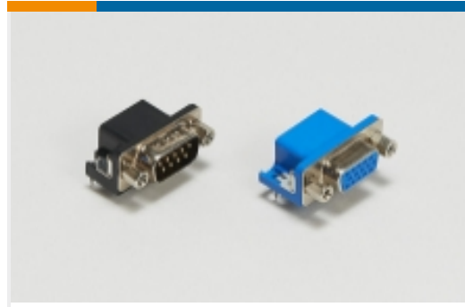
PCB D-Sub Connectors(172)