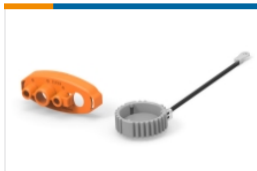
Connector Caps & Covers(21)