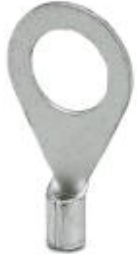
Ring cable lug, non-insulated, 1.1 ... 2.5 mm 2 , M8

Please be informed that the data shown in this PDF Document is generated from our Online Catalog. Please find the complete data in the user's documentation. Our General Terms of Use for Downloads are valid ( http://phoenixcontact.com/download )