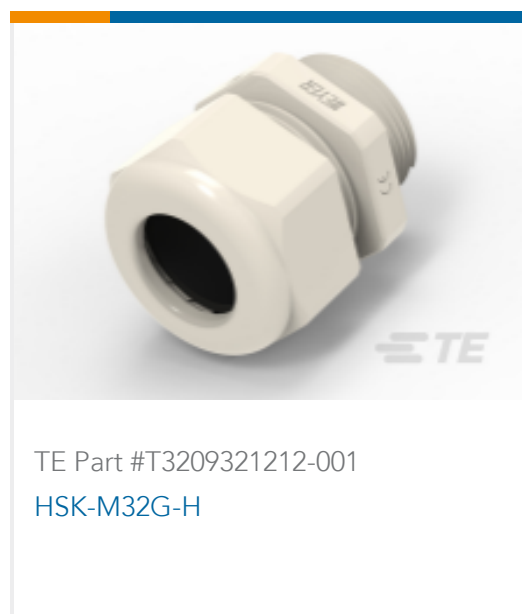
TE Part #T3209321212-001 HSK-M32G-H