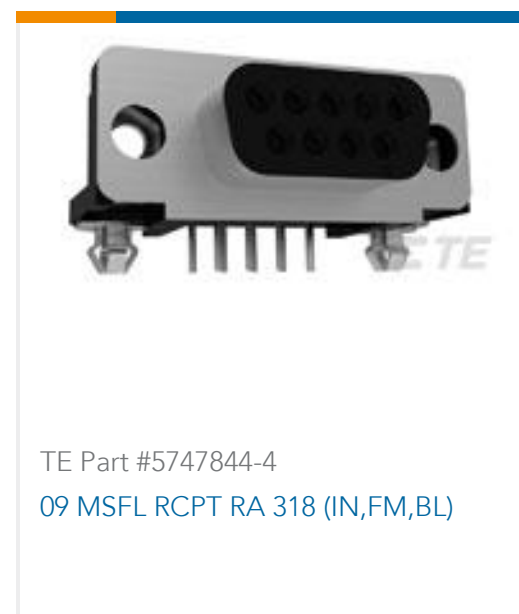
TE Part #5747844-4 09 MSFL RCPT RA 318 (IN,FM,BL)