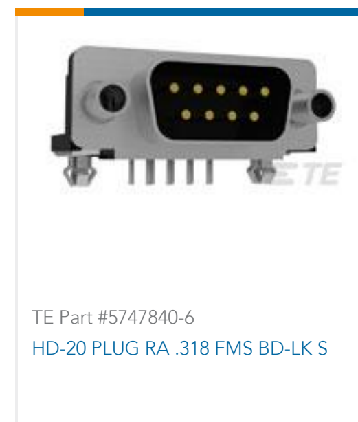
TE Part #5747840-6 HD-20 PLUG RA .318 FMS BD-LK S