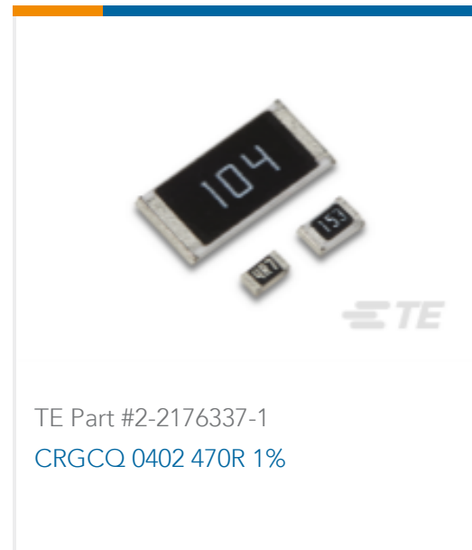
TE Part #2-2176337-1 CRGCO 0402 470R 1%