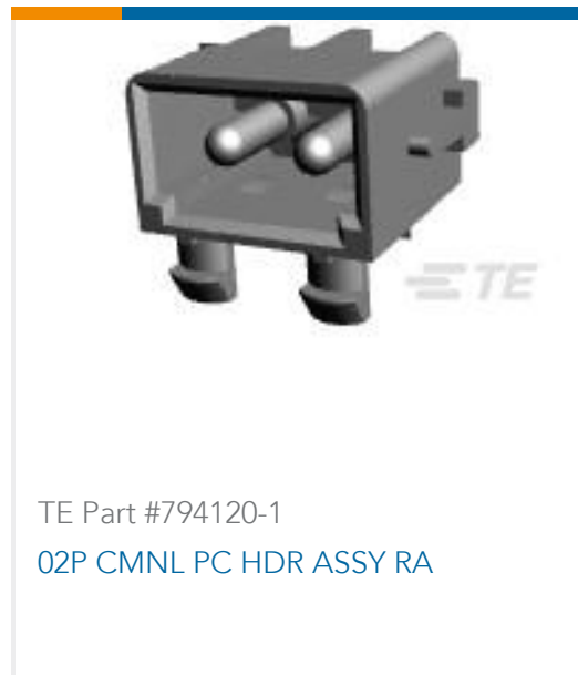
TE Part #794120-1 02P CMNL PC HDR ASSY RA