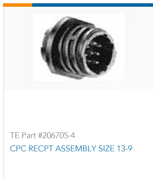
TE Part #206705-4 CPC RECPT ASSEMBLY SIZE 13-9