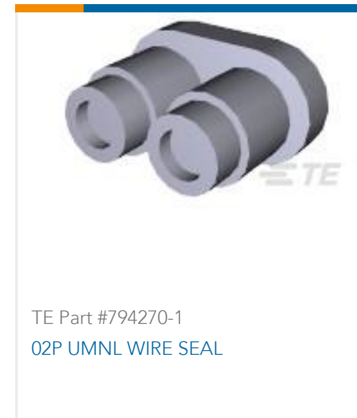
TE Part #794270-1 02P UMNL WIRE SEAL