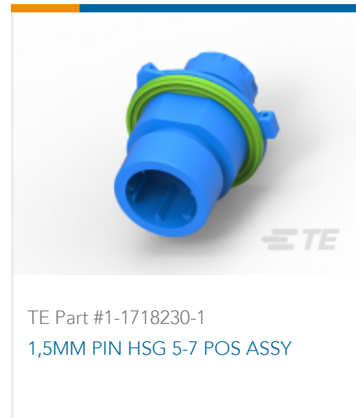
TE Part #1-1718230-1 1,5MM PIN HSG 5-7 POS ASSY