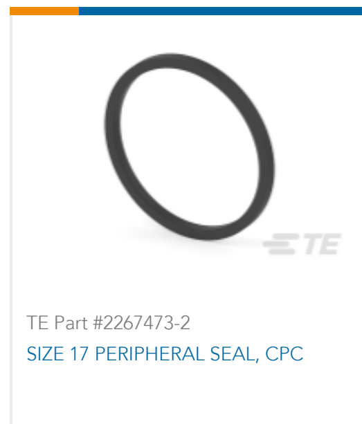
TE Part #2267473-2 SIZE 17 PERIPHERAL SEAL, CPC