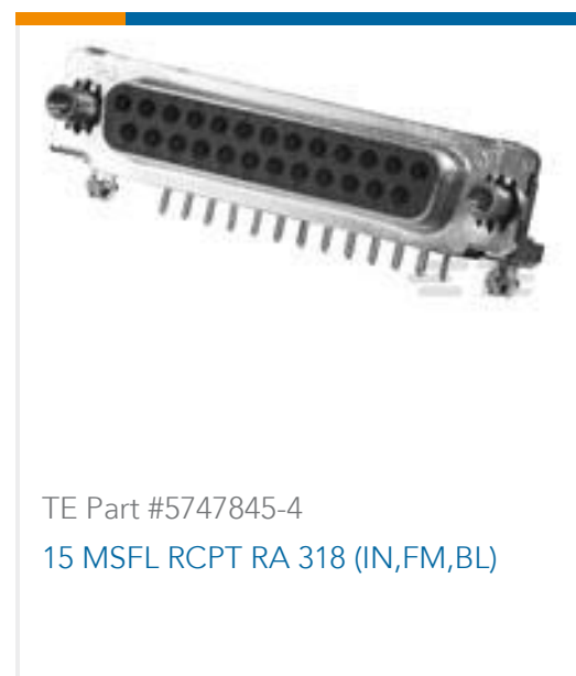
TE Part #5747845-4 15 MSFL RCPT RA 318 (IN,FM,BL)