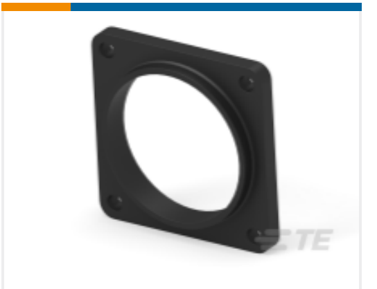
TE Part # 207299-4 FLANGE PLUG