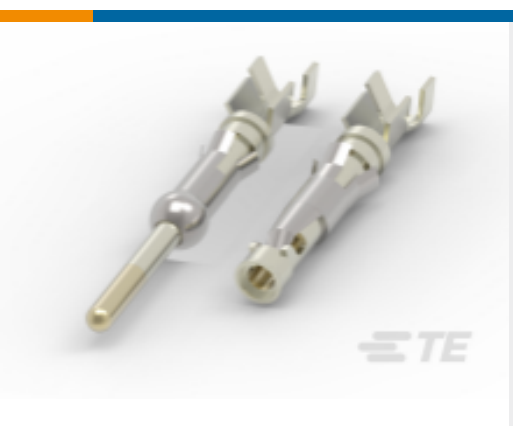
TE Part # CAT-AM71-T98B Strip Pin and Socket Contacts, Type III