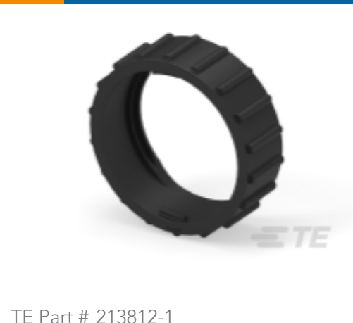
TE Part # 213812-1 COUPLING RING, SZ 23, CPC