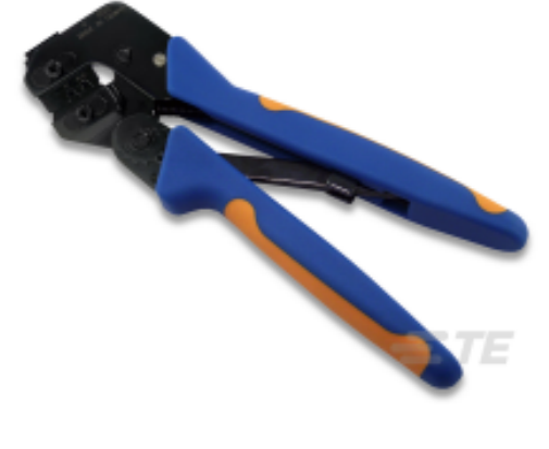
TE Part # 58495-1 PRO CRIMPER ASSY MULTIMATE