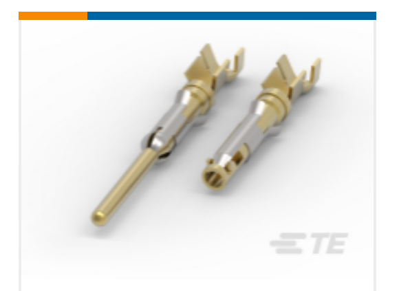
TE Part # CAT-AM71-T98D Pin and Socket Contacts, Type III, LP EMEA