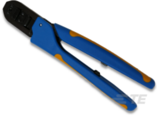
TE Part # 91542-1 CCII TYPE III+ PIN SKT 24-22 ASSY