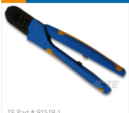
TE Part # 91519-1 CCII TYPE III+ PIN SKT 18-14 ASSY