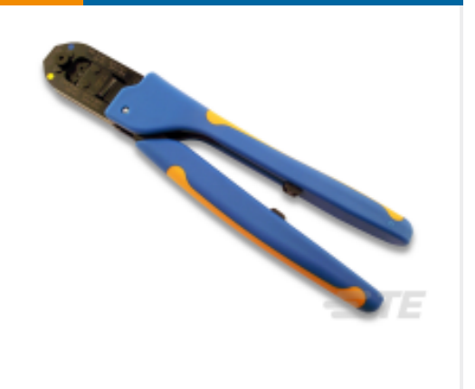
TE Part # 91505-1 CCII TYPE III+ 24-16 ASSY