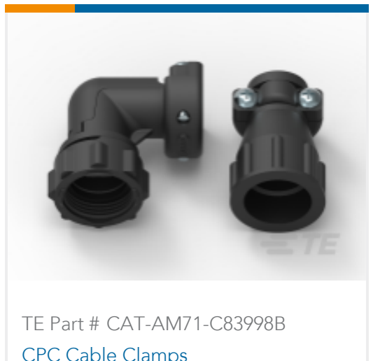
CPC Cable Clamps