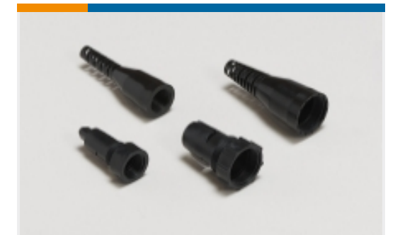
Connector Strain Relief(60)