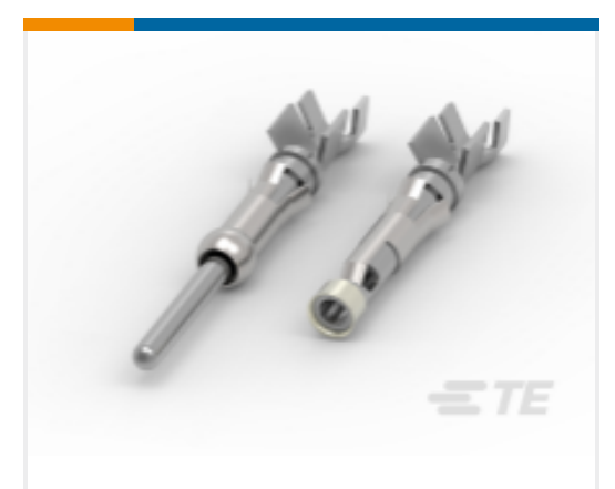
TE Part # CAT-AM71-T98F Strip Pin and Socket Contacts, Type III, High Current