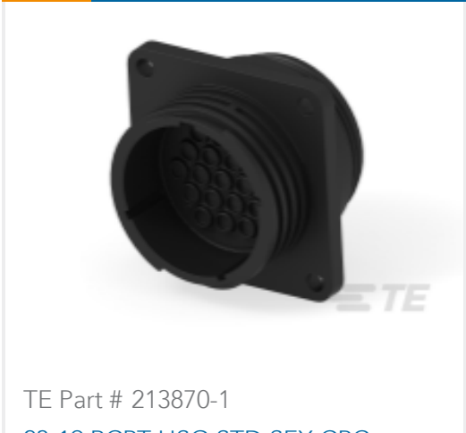
23-19 RCPT HSG,STD SEX,CPC