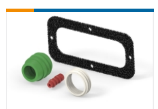
Connector Seals & Cavity Plugs(36)