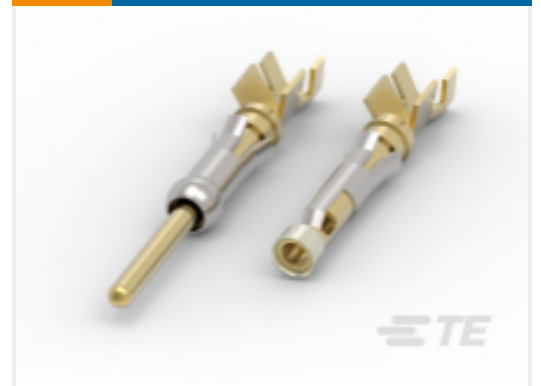
TE Part # CAT-AM71-T98G Pin and Socket Contacts, Type III, LP, High Current