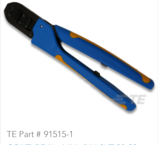
TE Part # 91515-1 CCII TYPE III+ MNL PIN SKT 30-20 ASSY