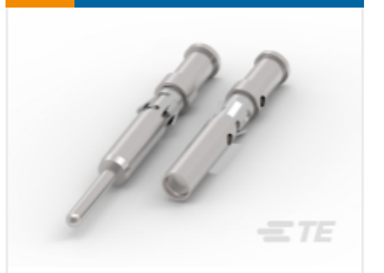
TE Part # CAT-AM71-T98A Strip Pin and Socket Contacts, Type III, LP