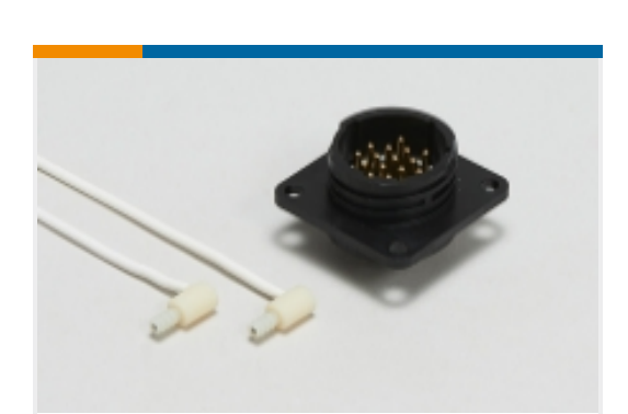
Circular Power Connectors(458)