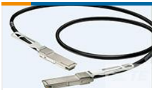
TE Part # 2829040-6 QSFP IB EDR, 30AWG, 2.0M