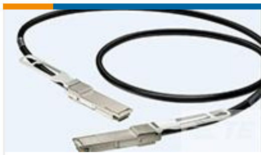
TE Part # 2829040-8 QSFP IB EDR, 26AWG, 3.0M