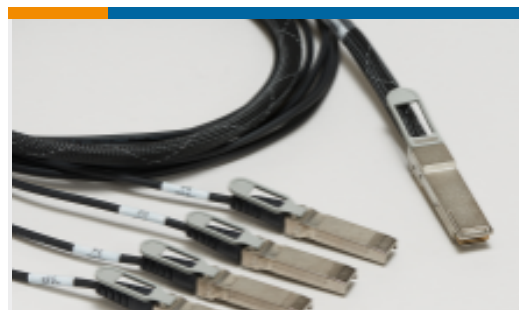
TE Part # 2821033-8 QSFP TO [4]SFP+, 28G, 1M, 33AWG