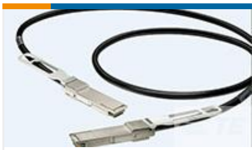
TE Part # 2829040-7 QSFP IB EDR, 26AWG, 2.0M