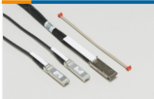
Pluggable I/O Cable Assemblies(13)