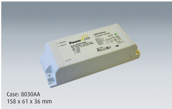
Case: 8030AA 158 x 61 x 36 mm