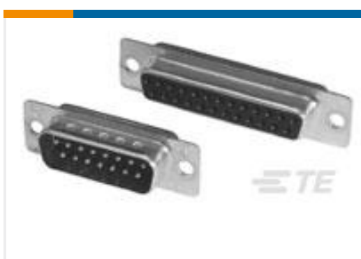
TE Part #4-1393483-7 V42254A1115C209=SUB D STIFTLI