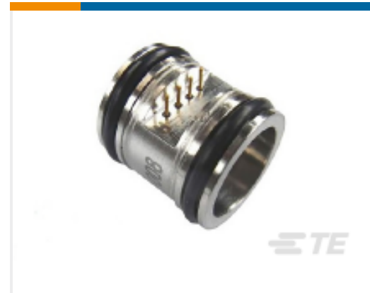
TE Part #DP86-300D 300 PSID MV DIFFERENTIAL PRESSURE SENSOR