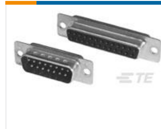
TE Part #5-747909-2 15 Rcpt Solder Cup, Gold Flash