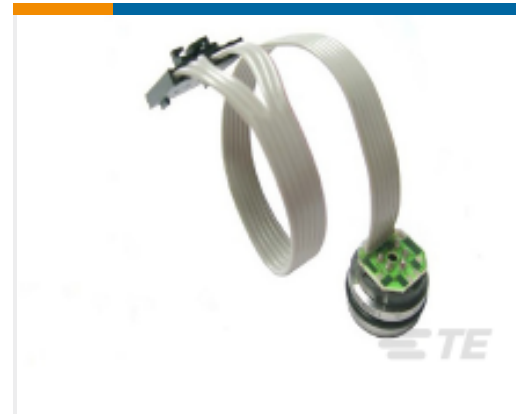
TE Part #86-100A-C 100 PSIA CABLE CONN MV PRESSURE SENSOR