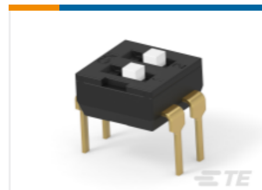
TE Part #2454982-1 ADE Next Gen 02 Pos. THT TU