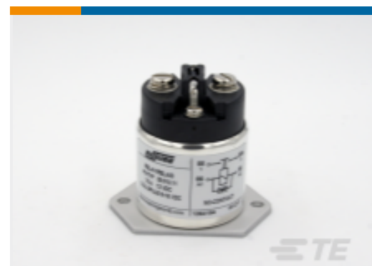
TE Part #K1060283 Relay 29-013-12