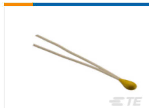
TE Part #GA10K3A11B DISCRETE 10K OHMS, +/-0.2C FROM 0C TO 70C