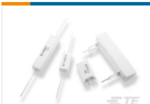
TE Part #1623783-8 Wirewound Resistor: Vertical Mount