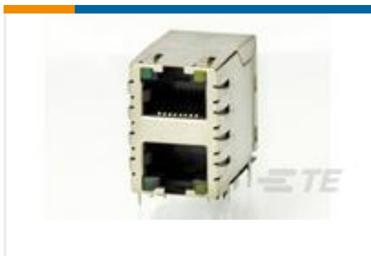
TE Part #6368011-3 STK MJ,2X1,SHLD,1135,G/Y/G/Y L