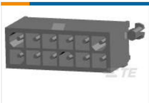
TE Part #1-770621-0 12P MINI UMNL DBL ROW HDR ASSY