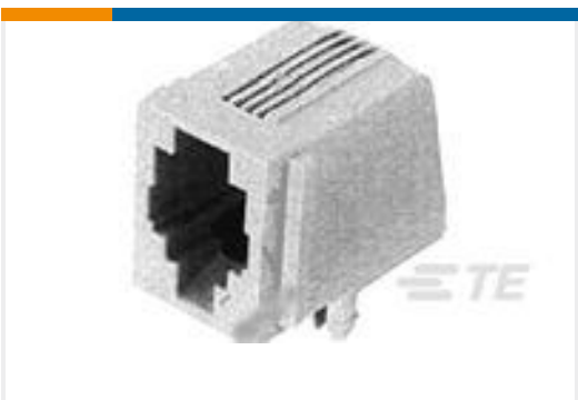
TE Part #5520249-2 MJ,R/A,4P,PNL STOP,TRAY