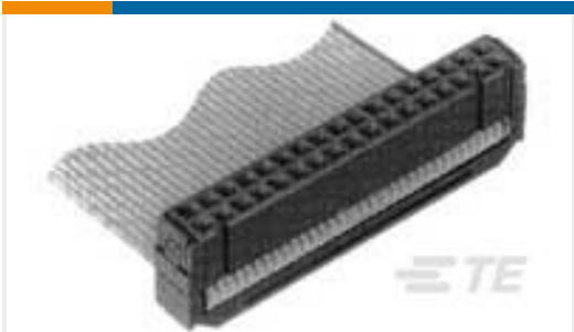
TE Part #1658623-7 30 NOVO MIL 30DP, LEAD FREE