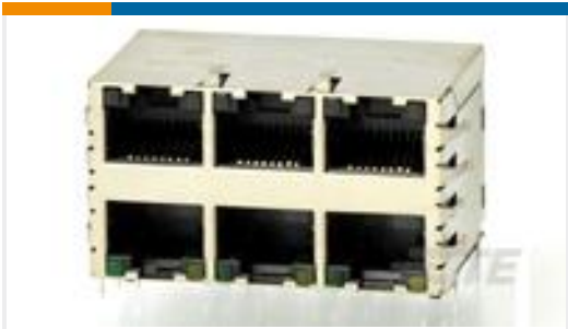
TE Part #5569256-1 STK MJ ASSY,8POS,2X3,SHLD,CAT5