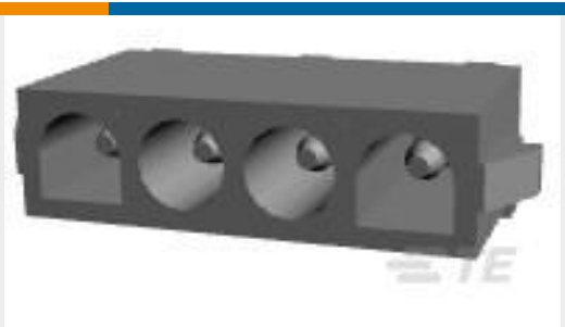
TE Part #350792-1 04P UMML PIN HDR ASSY 94VO