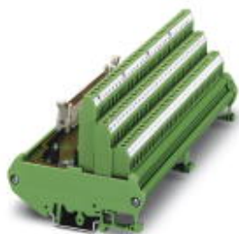
VARIOFACE sensor module, for connecting 32 p-n-p sensors, with LED

Please be informed that the data shown in this PDF Document is generated from our Online Catalog. Please find the complete data in the user's documentation. Our General Terms of Use for Downloads are valid ( http://phoenixcontact.com/download )