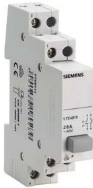
button, 4 NC 20 A 1 key gray