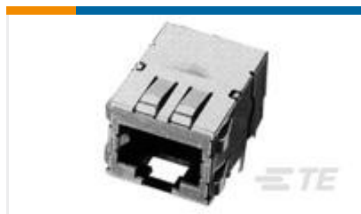
TE Part #3-5338556-1 8/8 MOD JACK ASSY SE