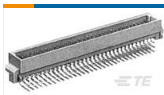
TE Part #5536437-4 ASSY,PIN,EUROCARD,TYPE C,LEAD- FREE,96 PO