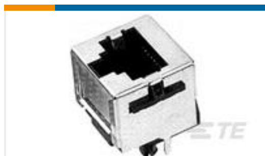
TE Part #5557969-1 MJ,TE,8P/8C,SHLD,PNL STOPS&G