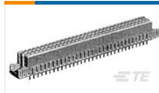
TE Part #5535070-5 ASSY,RECEPTACLE,EUROCARD,TYPE AU