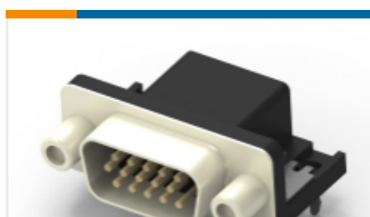
TE Part #2311775-1 AMPL PLUG, HD22, R/A, 15P, S/L