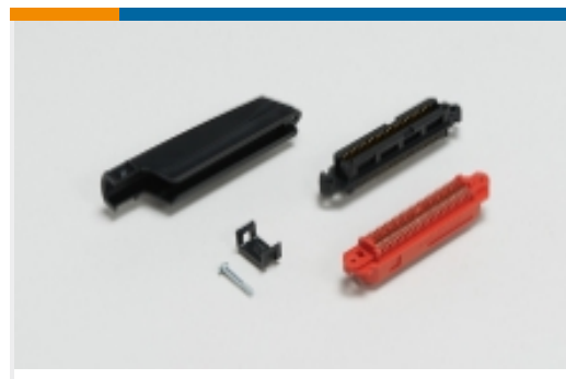
IDC D-Sub Connectors(3)