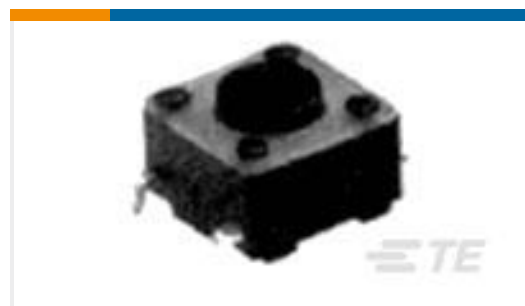
TE Part #2-1437565-7 FSM2JSMA=SMT,TACTILE,PB SWITCH