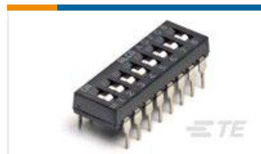
TE Part #1-1825059-3 ADF04S04=DIP SWT,FLUSH,SMT-GW