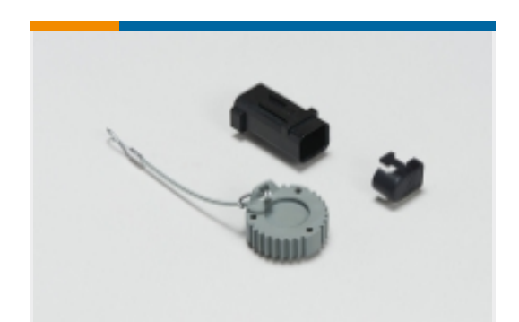
Automotive Connector Caps & Covers (18)