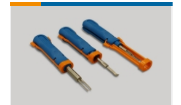
Insertion & Extraction Tools(5)