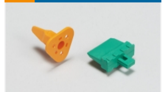
Automotive Connector Locks & Position Assurance(10)