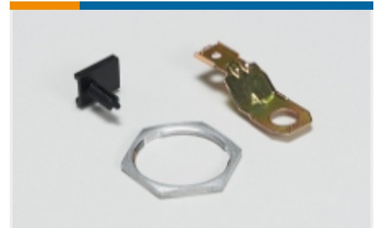
Other Automotive Connector Accessories(7)