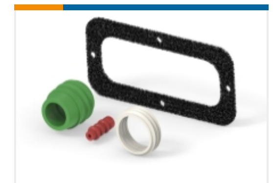
Connector Seals & Cavity Plugs(11)