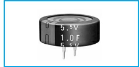
Marking color : White print on an indigo sleeve