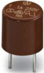
Replacement fuse, for INTERBUS-ST modules

Please be informed that the data shown in this PDF Document is generated from our Online Catalog. Please find the complete data in the user's documentation. Our General Terms of Use for Downloads are valid ( http://phoenixcontact.com/download )