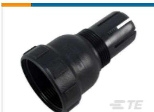
TE Part #M902-2194 BKSHL, 9SZ, CBL SZ .570-.710, HD10