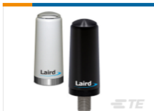
TE Part #TRA6927M3PW-001 OMNI,DB,Ph,698/1710 MHz WHT,3 dBi,100W,