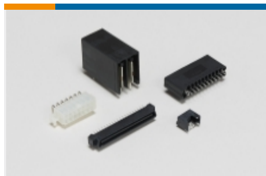
Standard Rectangular Connectors(2)