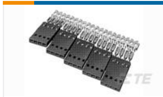
TE Part # 5-103970-2 8X3 MTE RCPT SR RIBBED .100CL