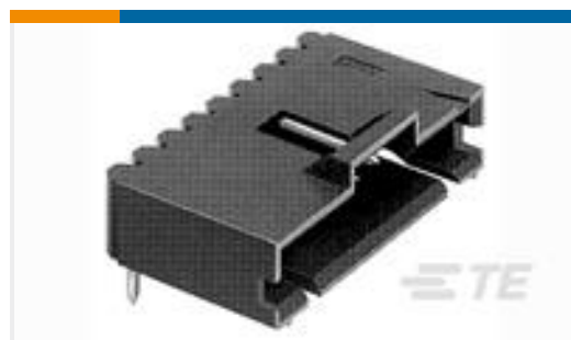
TE Part #103906-3 04 MTE HDR SRRA LATCH .100CL