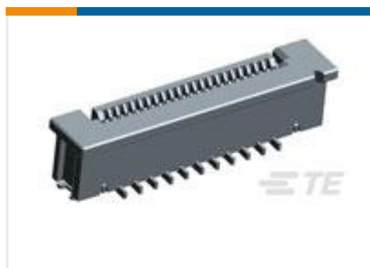
TE Part #1-1734742-4 .5 FPC VT ZIF Type-A 14 CONT