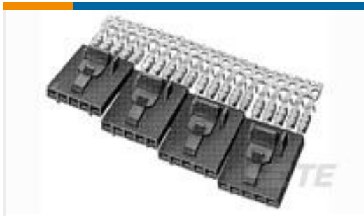
TE Part # 5-103958-2 8X3 MTE RCPT SR LATCH .100CL