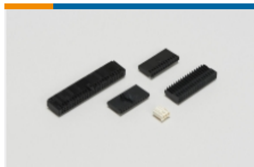
Wire-to-Board Connector Assemblies & Housings(585)