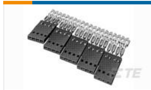
TE Part # 5-103973-2 8X3 MTE RCPT SR RIBBED .100CL