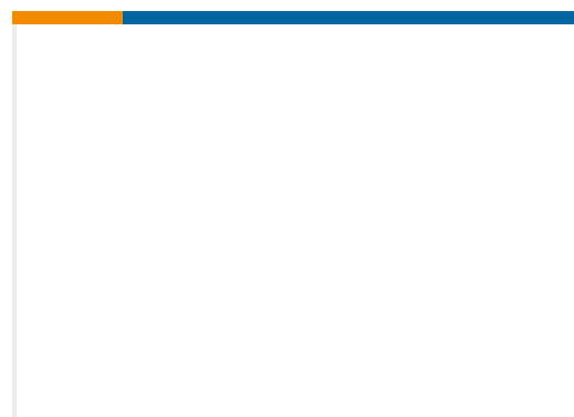
TE Part #M7139-200PG-500000 PRESS XDCR M7139-200PG-500000