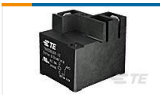
TE Part #3-1419104-3 T9AS5D22-12