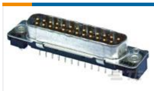
TE Part #5748026-1 15 PLUG SP/FMS (IN,SL)