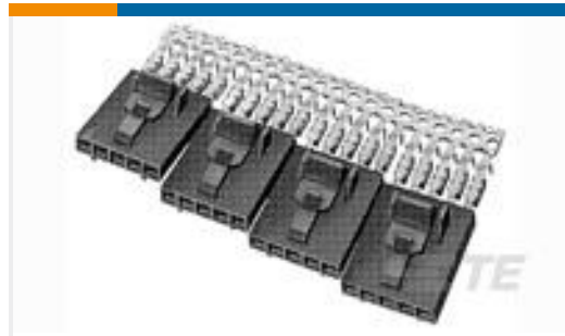
TE Part # 5-103961-2 8X3 MTE RCPT SR LATCH .100CL