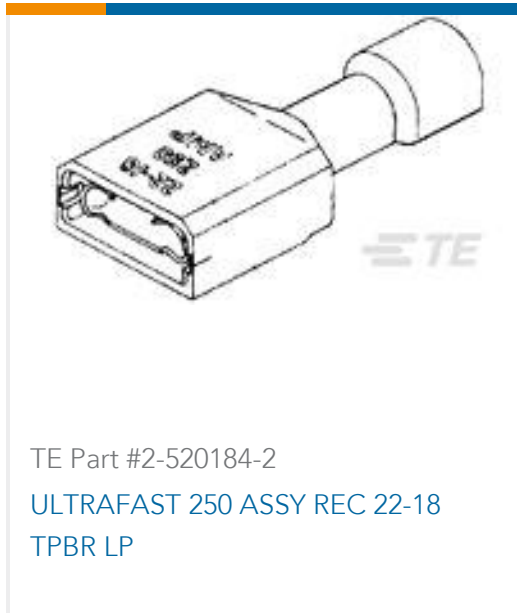
TE Part #2-520184-2 ULTRAFAST 250 ASSY REC 22-18 AWG TPBR LP