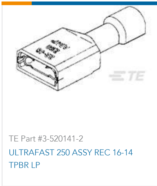
TE Part #3-520141-2 ULTRAFAST 250 ASSY REC 16-14 TPBR LP