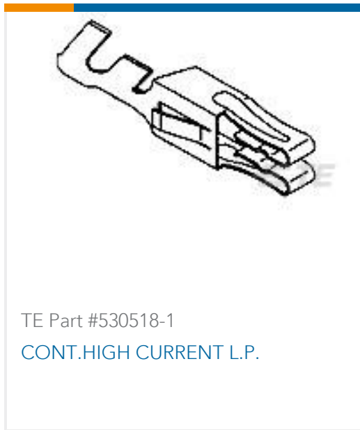
TE Part #530518-1 CONT.HIGH CURRENT L.P.