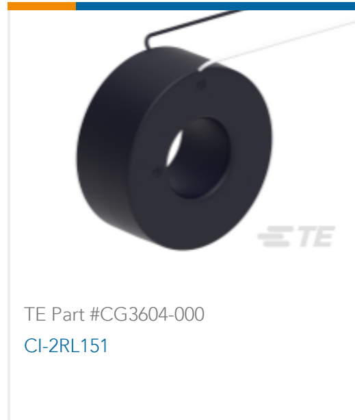
TE Part #CG3604-000 CI-2RL151