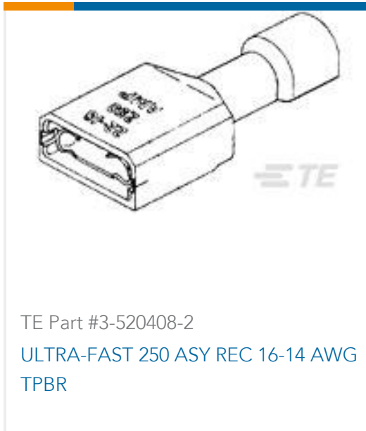
TE Part #3-520408-2 ULTRA-FAST 250 ASY REC 16-14 AWG TPBR