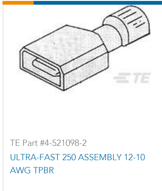
TE Part #4-521098-2 ULTRA-FAST 250 ASSEMBLY 12-10 AWG TPBR