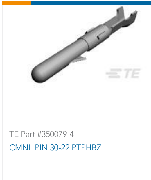
TE Part #350079-4 CMNL PIN 30-22 PTPHBZ