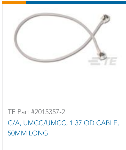
TE Part #2015357-2 C/A, UMCC/UMCC, 1.37 OD CABLE, 50MM LONG