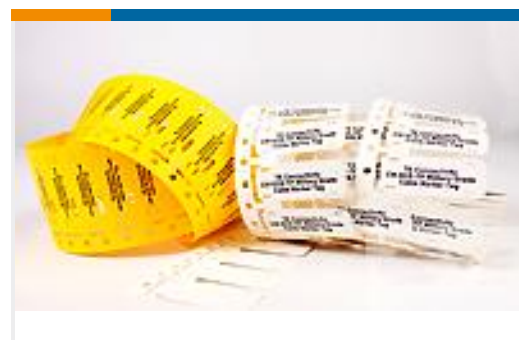
TE Part #768838-000 CM-SCE-TP-1/4-4H-9