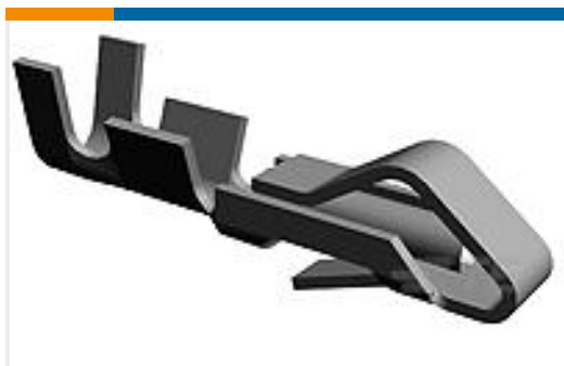
TE Part #3-640252-1 045 POST CONT 0126PTPBR