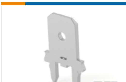
TE Part #2376595-2 250 FASTON PCB TAB TPBR