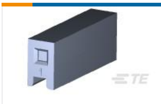
TE Part #640251-1 01P SL156 HSG W/O RAMP NATL