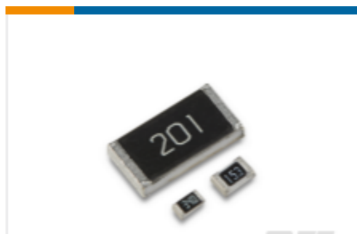
TE Part #3-2176329-2 CRGP 1210 3K9 1%