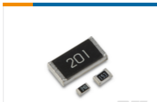
TE Part #3-2176330-7 CRGP 2010 10K 1%