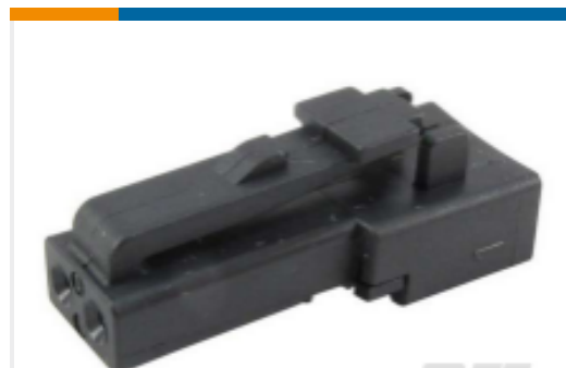
TE Part #DTMN06-2S PLG, 2P, BLK, N, NON-ENVIR