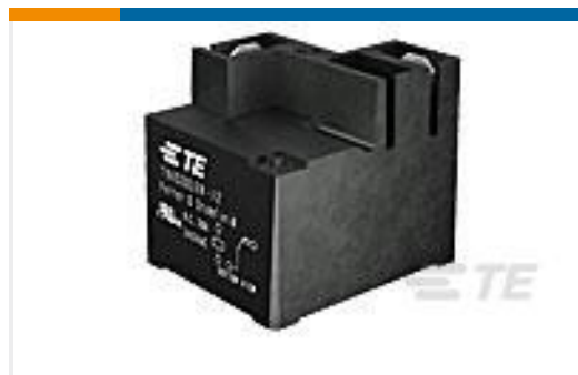
TE Part #1-1419104-6 T9AS1D22-110