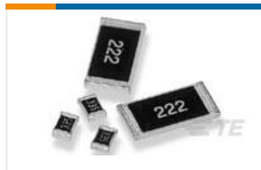
TE Part #8-1879494-9 CRGH0603 5% 4K7 0.2W