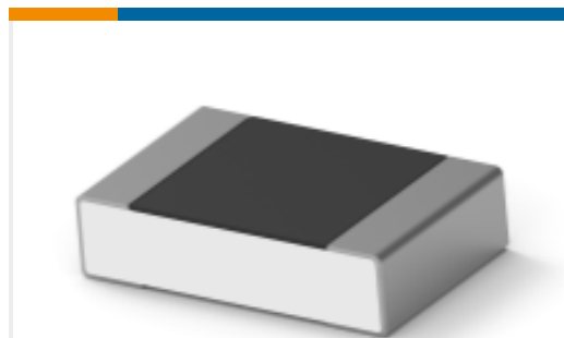
TE Part #2176378-1 RQ 0805 10R 0.1% 10PPM 5K RL