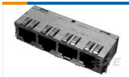
TE Part #1-5406203-2 MJ,ASSY,4P,8POS,CAT5,PNL TABS,,1S /T