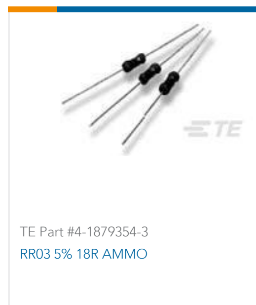
TE Part #4-1879354-3 RR03 5% 18R AMMO