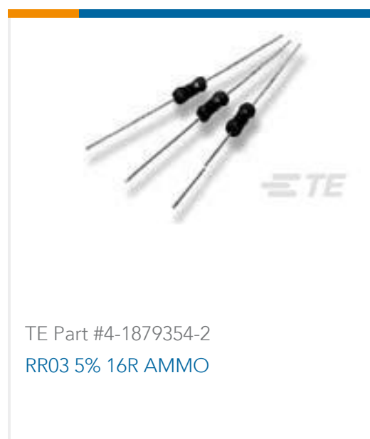
TE Part #4-1879354-2 RR03 5% 16R AMMO