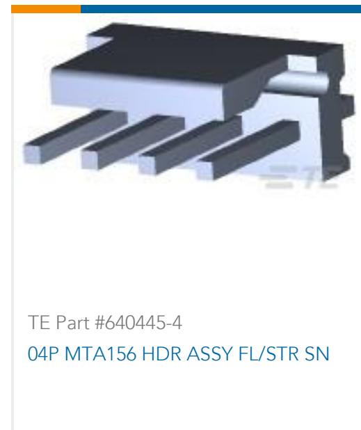
TE Part #640445-4 04P MTA156 HDR ASSY FL/STR SN