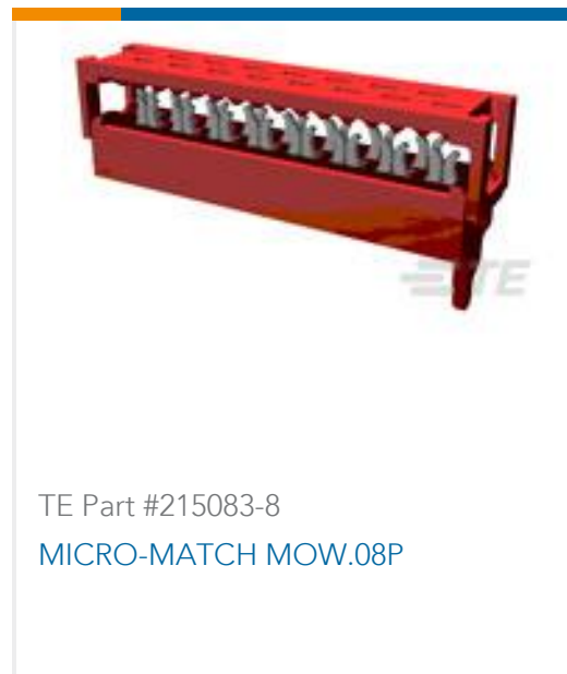
TE Part #215083-8 MICRO-MATCH MOW.08P