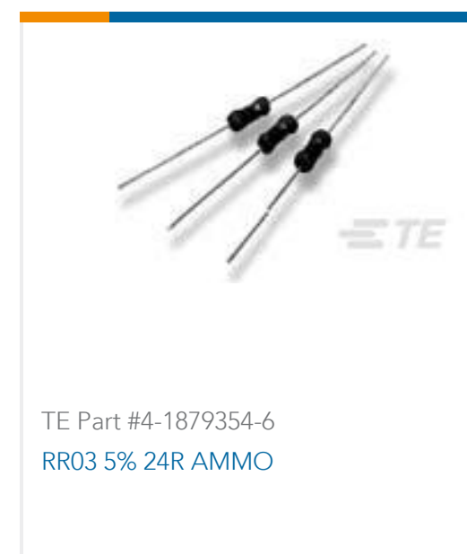
TE Part #4-1879354-6 RR03 5% 24R AMMO