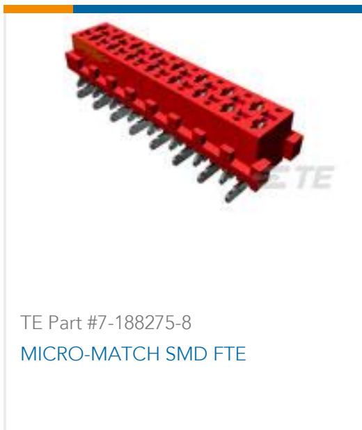
TE Part #7-188275-8 MICRO-MATCH SMD FTE