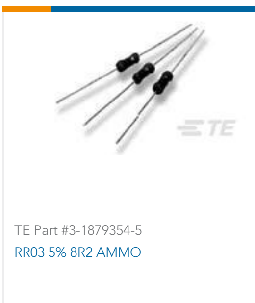
TE Part #3-1879354-5 RR03 5% 8R2 AMMO