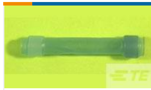
TE Part #650138-000 D-436-0098