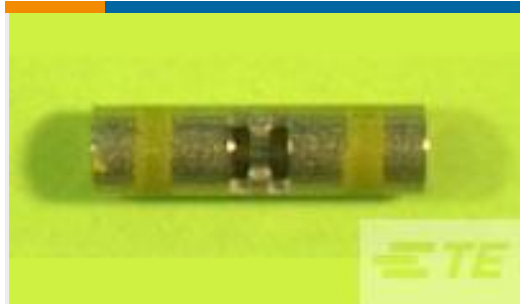
TE Part #680329-000 D-609-09