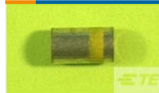
TE Part #680106-000 D-609-05