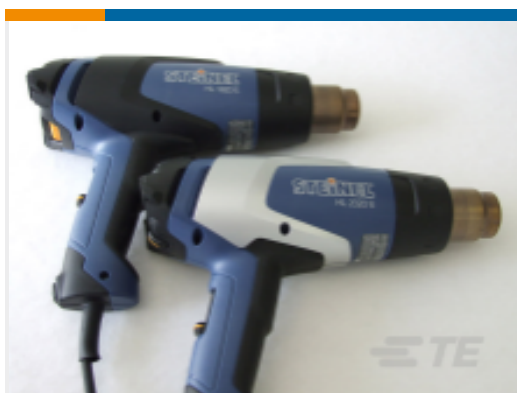
TE Part # EG8162-000 HL1920E-230V-EURO