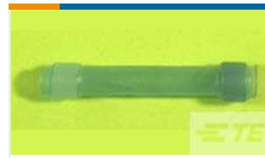
TE Part #650136-000 D-436-0096