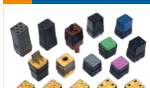
TE Part #ZPF000000000099705 DMC-M 99-01 BN