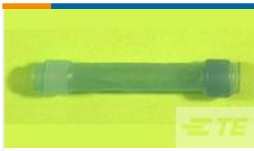
TE Part #650137-000 D-436-0097