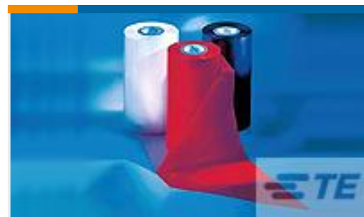
TE Part #C36369-000 1330-0600-T200