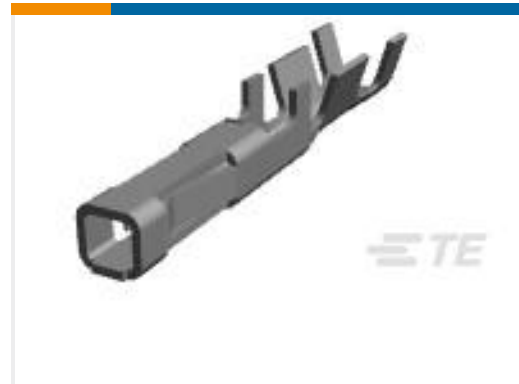
TE Part #1-794610-2 MICRO MNL RPT CNT,LS PC 30AU L