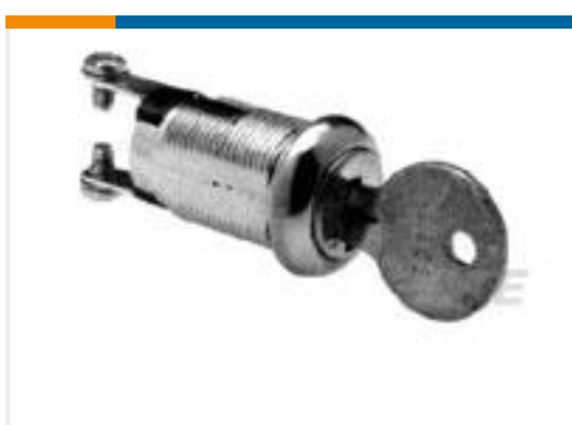
TE Part #2-1437597-7 2SWK231AL101=non ul keylock