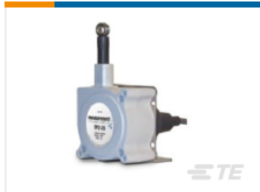
TE Part #SP2-25 STRING POT 25 INCH RANGE