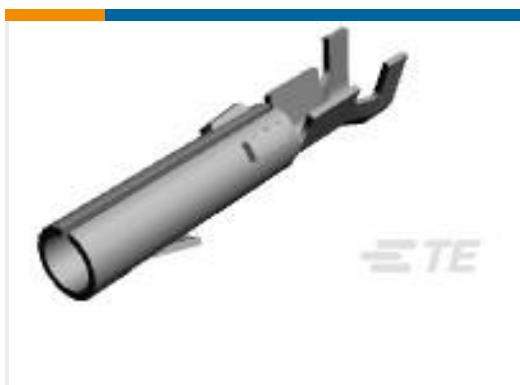
TE Part #60617-1 CMNL SOK SNBR L/P