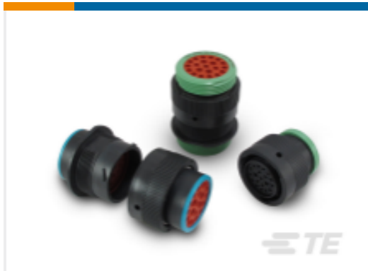
TE Part #HDP26-18-6SN DEUTSCH HDP20 Housings