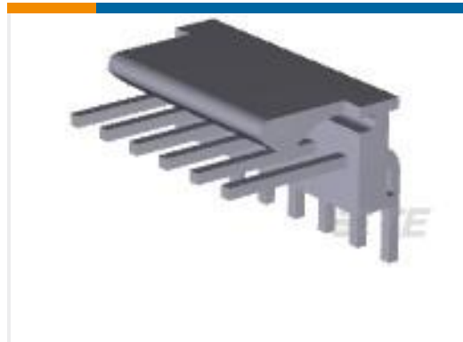
TE Part #640457-6 06P MTA100 HDR ASSY SQ R/A F/L