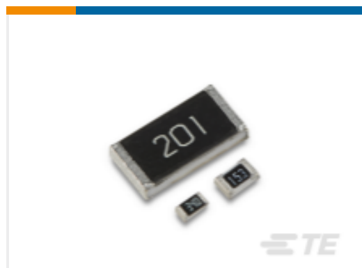
TE Part #2-2176325-2 CRGP 0402 560R 1%