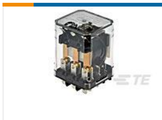
TE Part #9-1393116-0 KUMP-14D18-12=KU