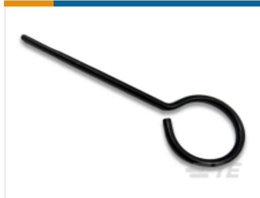
TE Part # 200893-2 INSERTION TOOL CONT