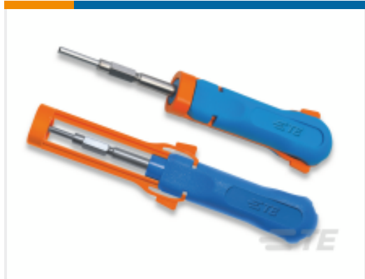
TE Part # 539972-1 EXTRACTION TOOL