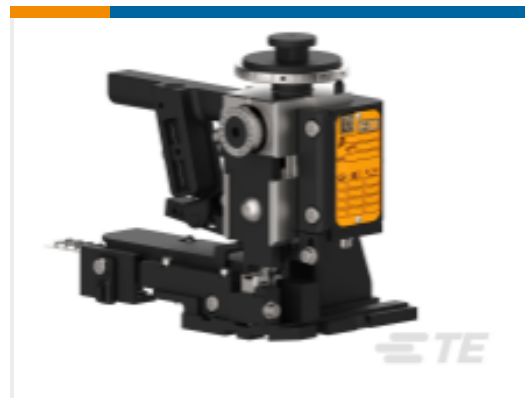
TE Part # 2151101-1 OCEAN_2.0_APPLICATOR-S-090F120O-RSM