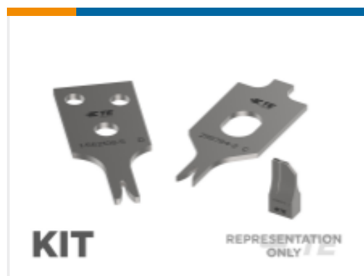
TE Part # 7-2151101-7 OCEAN_2.0_SPARE_PART_KIT-090F120O