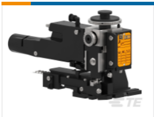
TE Part # 5-2151101-2 OCEAN_2.0_APPLICATOR-S-090F120O-RSA