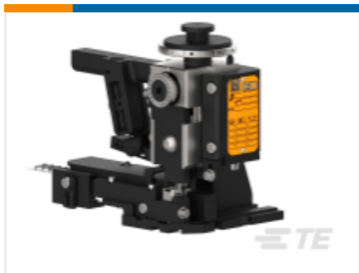
TE Part # 5-2151101-1 OCEAN_2.0_APPLICATOR-S-090F120O-RSM