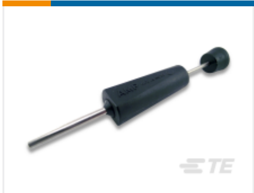
TE Part # 305183 EXTRACT TOOL TYPE 2 20-16