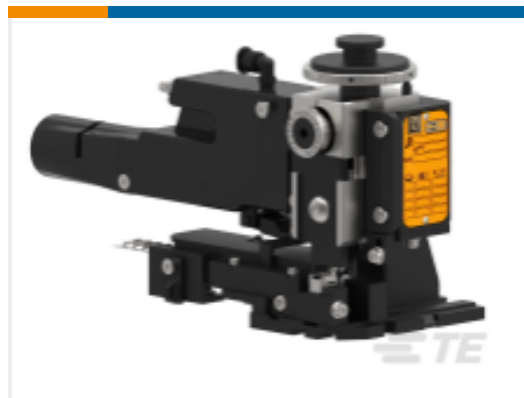
TE Part # 2151101-2 OCEAN_2.0_APPLICATOR-S-090F120O-RSA