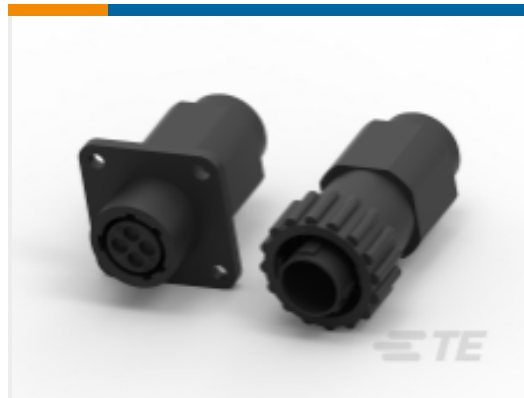
TE Part # CAT-AM71-C83998Y One-Piece Connector, Sealed, CPC Series 1