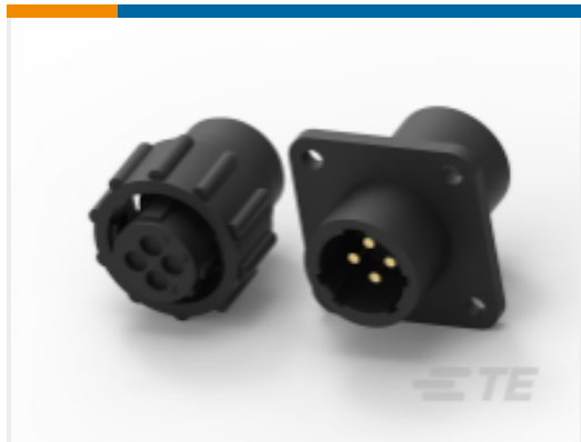
TE Part # CAT-AM71-C83998J Cable/Panel Mount Connector, CPC Series 1