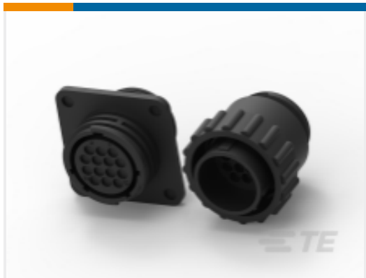
TE Part # CAT-AM71-C83998K Circular Connector, Environmentally Sealed, CPC Series 6