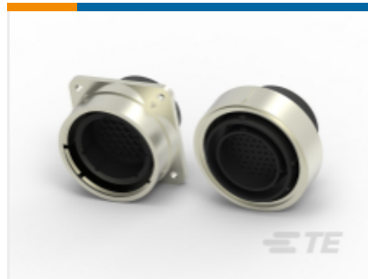
TE Part # CAT-AM71-C83998C Circular Plastic Connector, CMC Series 1