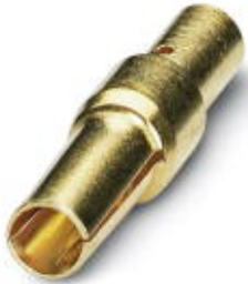
Crimp contact, turned, Single contact, contact diameter: 1 mm, crimp range: 0.14 mm 2 ... 0.56 mm 2

Please be informed that the data shown in this PDF Document is generated from our Online Catalog. Please find the complete data in the user's documentation. Our General Terms of Use for Downloads are valid ( http://phoenixcontact.com/download )