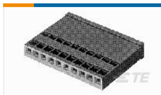
TE Part #87175-2 01 LOCKING CLIP HSG SR .100CL