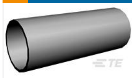
TE Part #3-745130-9 SHLDING FERRULE,PLTD,BULK PKG