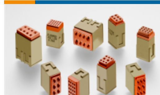
TE Part #YCTJ122E05EC015000 MODULE ASSY