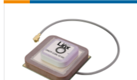
TE Part #ANT-GNCP-C25L12100 Antenna GNSS L1L2 25x25 LNA 1.13 UFL