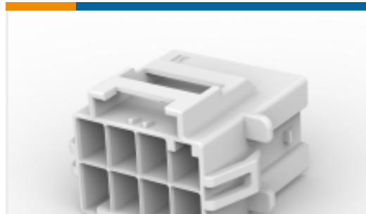
TE Part #1-1971772-3 Standard Temperature Caps | POWER TRIPLE LOCK