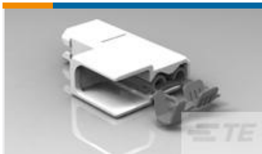
TE Part #521600-2 ULTRA-POD 187 ASY REC 22-18 AWG TPBR