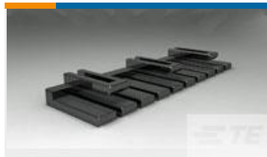
TE Part #1969443-2 EP 2.5 TPA Retainer, 2 Pos