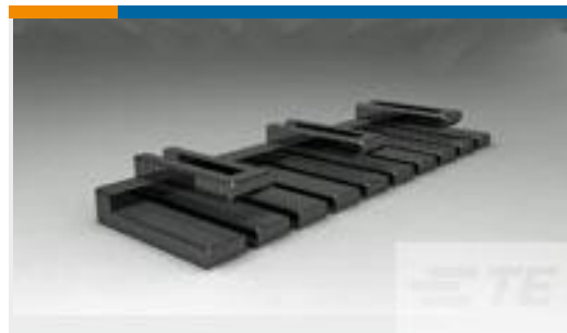
TE Part #1-1969443-0 EP 2.5 TPA Retainer, 10 Pos