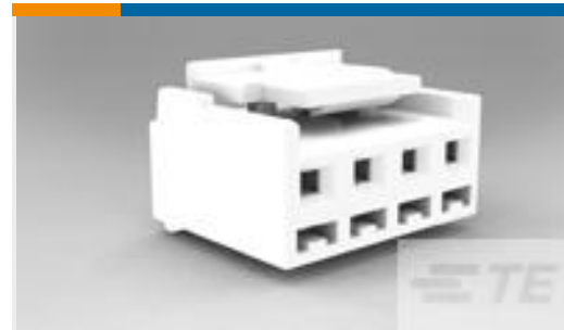
TE Part #2132781-9 09P EP-II HOUSING, NATURAL