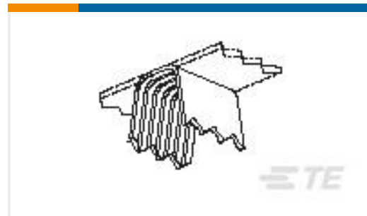
TE Part #1601601-1 L061/076D16B=RTM 1100-3200