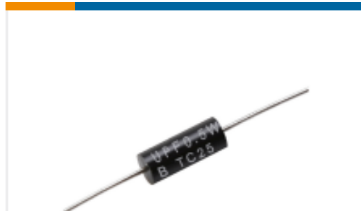
TE Part #2176162-7 UPF25 0.1% 5PPM 250R