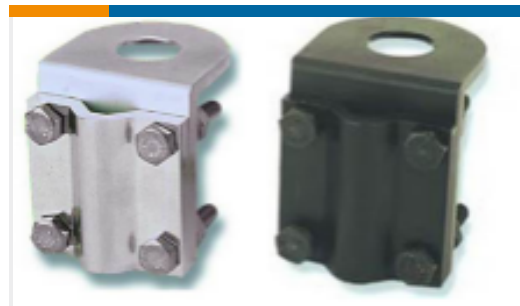
TE Part #LBMB9034-L MOUNT,MIR,3/4 BLK,STD,90DEG