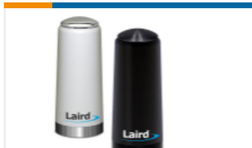
TE Part #TRA6927M3PW-001 OMNI,DB,Ph,698/1710 MHz WHT,3 dBi,100W,