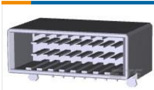
TE Part #178307-5 DYNAMIC D3100 HDR ASSY 16P