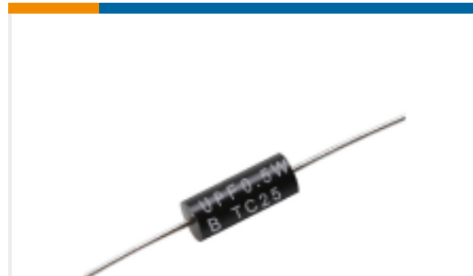
TE Part #2176163-6 UPF50 0.1% 5PPM 1K0