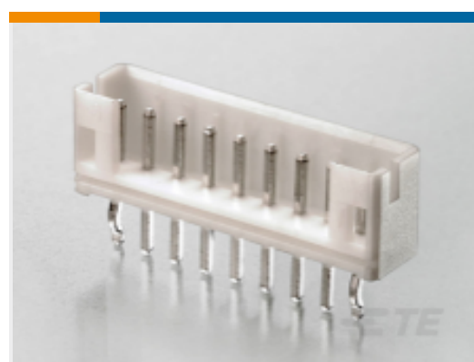
TE Part # CAT-H857-H34225 AMP HPI 2.5 mm Headers