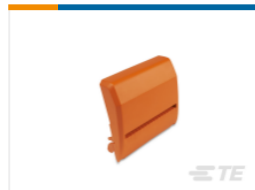
TE Part #1-2186529-1 T2212-PRINTER-CUTTER