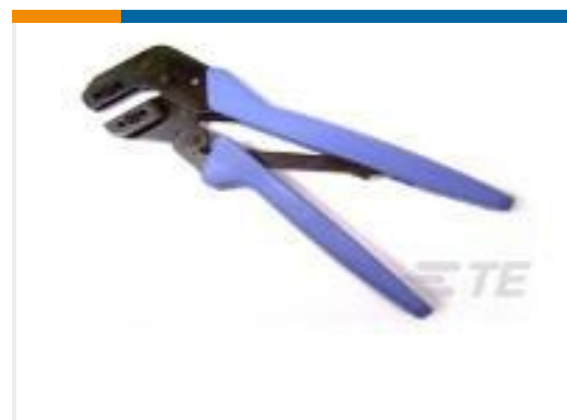
TE Part #58525-1 PROCRIPPER TOOL & DIE