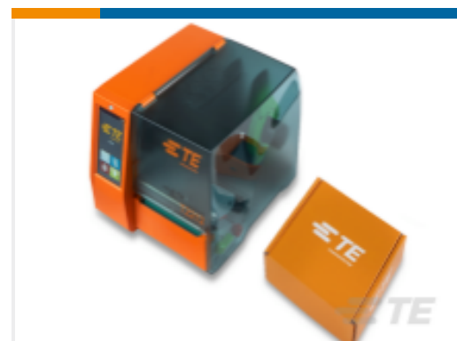
TE Part #1-2186528-1 T2212-SWARE-PRINTER