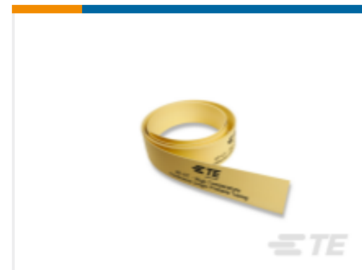
TE Part #EL8112-000 ZHD-CT LFH & Fluid Resistant Tube