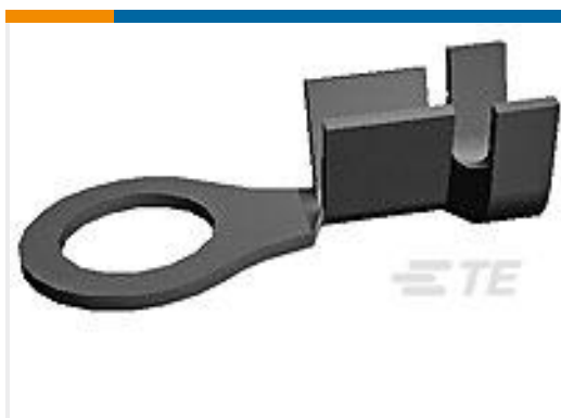
TE Part #626037-2 RING TONGUE TERMINAL 4.0-6.0 MM2 TPBR