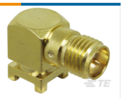
TE Part # CONREVSMA002-SMD-G RP-SMA RA Jack 50 Ohm PCB Surface Mount