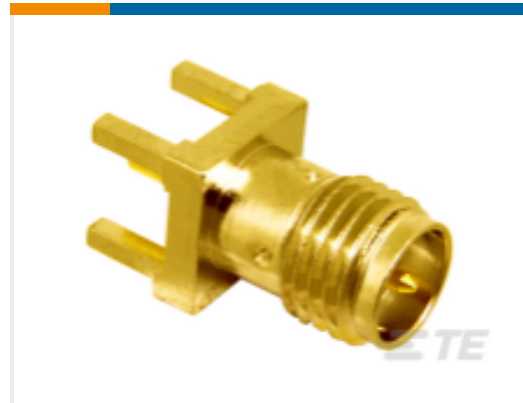
TE Part # CONREVSMA001-G RP-SMA Jack 50 Ohm PCB Through Hole