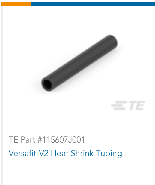
TE Part #115607J001 Versafit-V2 Heat Shrink Tubing