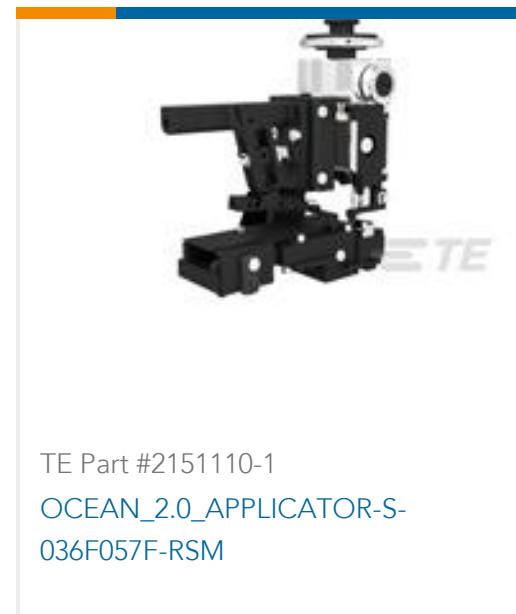
TE Part #2151110-1 OCEAN_2.0_APPLICATION-S- 036F057F-RSM