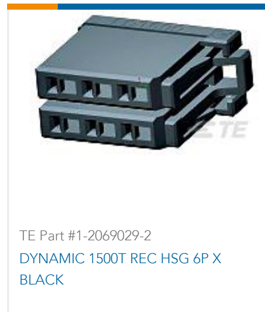
TE Part #1-2069029-2 DYNAMIC 1500T REC HSG 6P X BLACK