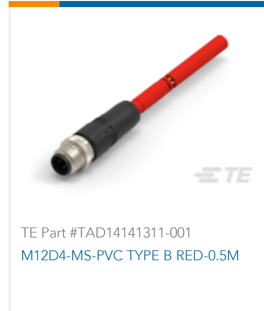
TE Part #TAD14141311-001 M12D4-MS-PVC TYPE B RED-0.5M