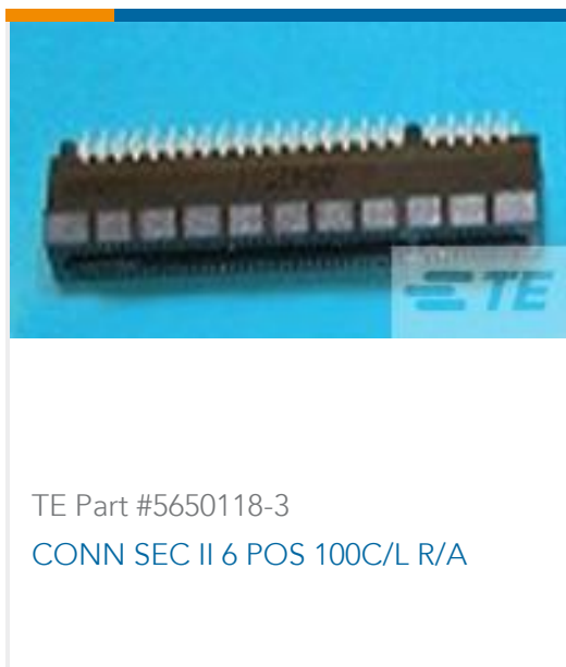
TE Part #5650118-3 CONN SEC II 6 POS 100C/L R/A