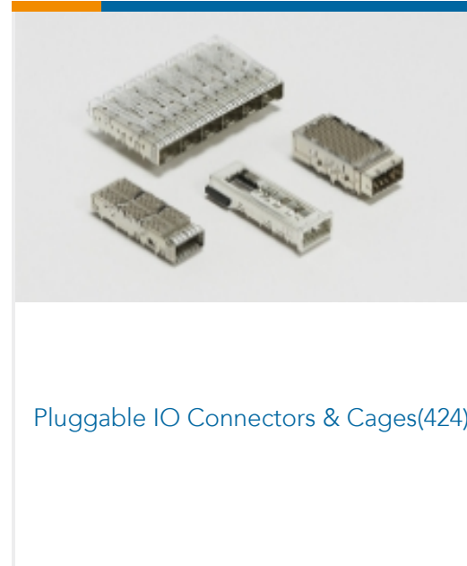
Pluggable IO Connectors & Cages(424)