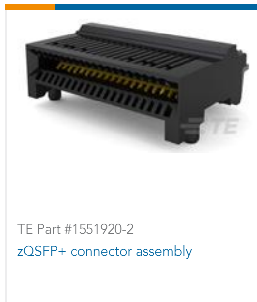
TE Part #1551920-2 zQSFP+ connector assembly