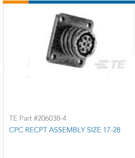
TE Part #206038-4 CPC RECPT ASSEMBLY SIZE 17-28