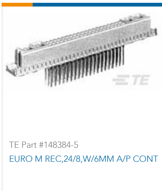
TE Part #148384-5 EURO M REC, 24/8, W/6MM A/P CONT