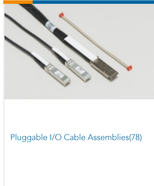
Pluggable I/O Cable Assemblies(78)