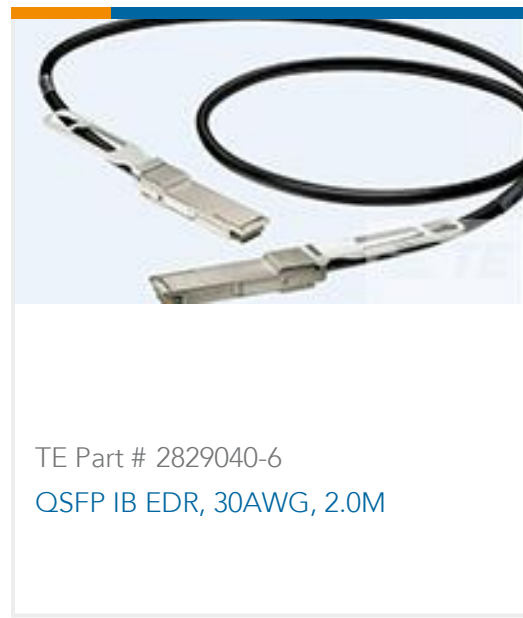
TE Part # 2829040-6 QSFP IB EDR, 30AWG, 2.0M