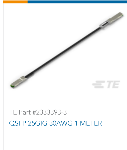
TE Part #2333393-3 QSFP 25GIG 30AWG 1 METER