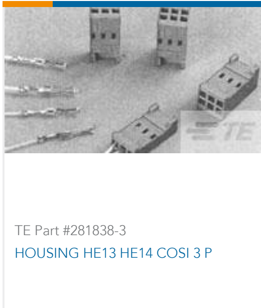
TE Part #281838-3 HOUSING HE13 HE14 COSI 3 P