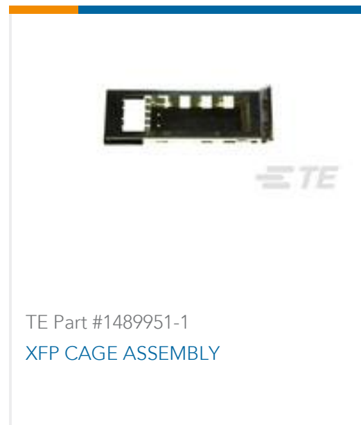
TE Part #1489951-1 XFP CAGE ASSEMBLY