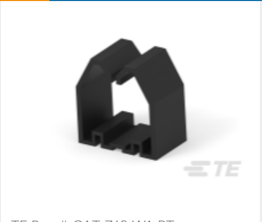
TE Part # CAT-Z62-W1-RT Wiring Duct Accessories: PVC and LSHF Ranges, Black, Gray