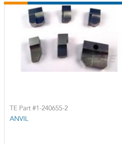
TE Part #1-240655-2 ANVIL