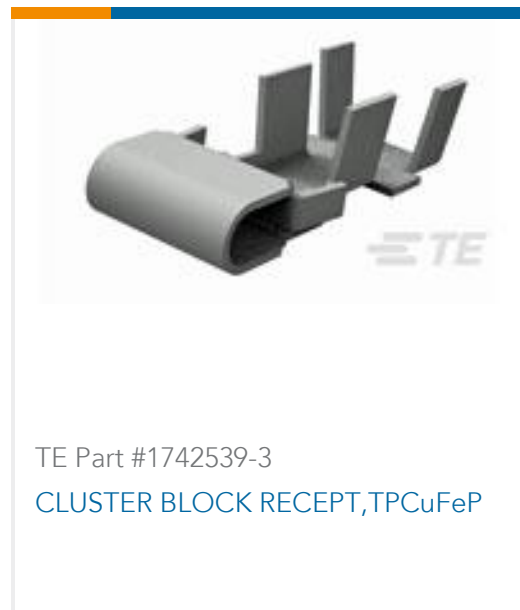
TE Part #1742539-3 CLUSTER BLOCK RECEP,TPCuFeP