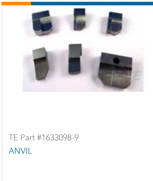
TE Part #1633098-9 ANVIL