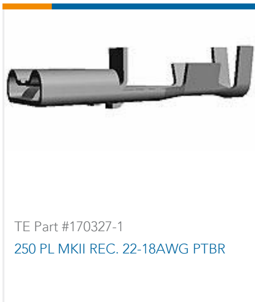
TE Part #170327-1 250 PL MKII REC. 22-18AWG PTBR