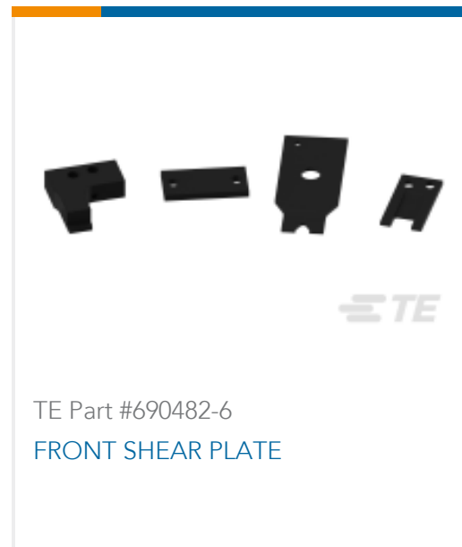
TE Part #690482-6 FRONT SHEAR PLATE