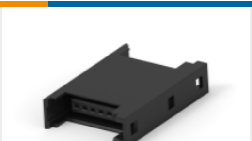
TE Part # 5-1473571-6 RITS.JUNCTION BOX 2D 6P F/H