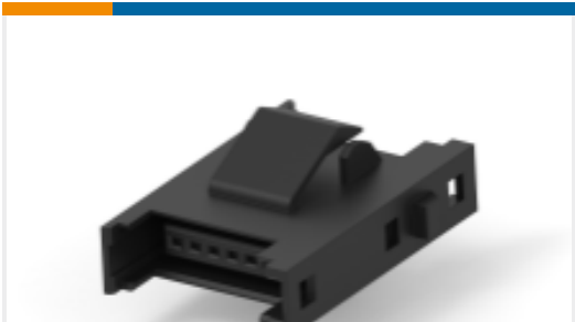
TE Part # 1473571-6 RITS.JUNCTION BOX 2D 6P P/M