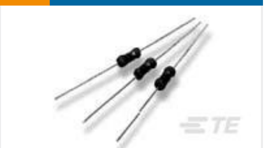
TE Part #1625890-7 2W SM M/OX 5% 120K