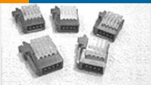
TE Part #4-1473562-4 RITS CONN. PLUG ASSY 4P GREEN