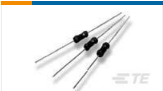
TE Part #1-1625890-6 2W SM M/OX 5% 180K