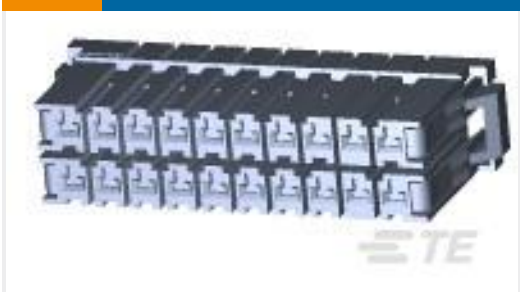
TE Part #1-917659-8 DYNAMIC 3200 REC HSG 20P