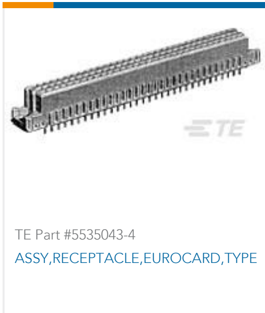
TE Part #5535043-4 ASSY,RECEPTACLE,EUROCARD,TYPE