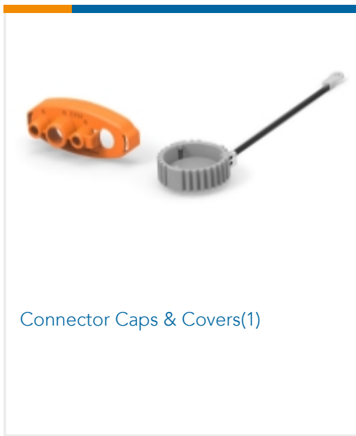
Connector Caps & Covers(1)