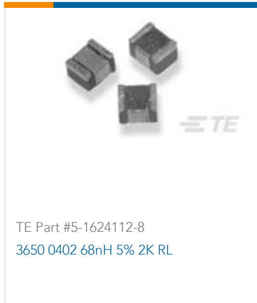
TE Part #5-1624112-8 3650 0402 68nH 5% 2K RL