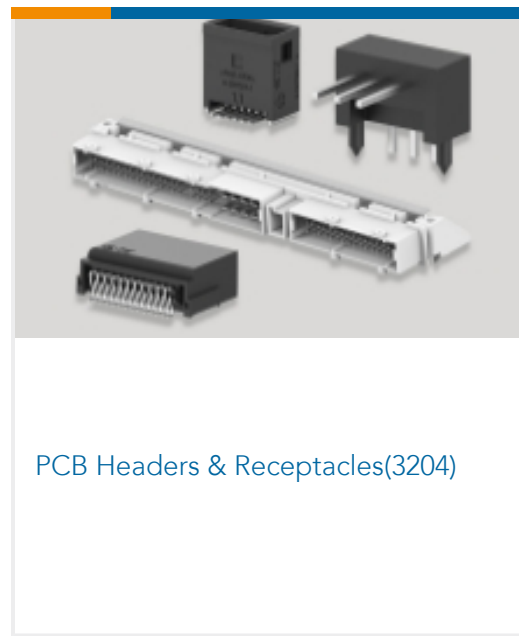
PCB Headers & Receptacles(3204)