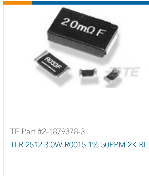
TE Part #2-1879378-3 TLR 2512 3.0W R0015 1% 50PPM 2K RL