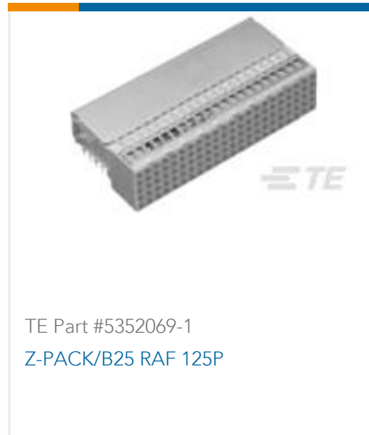
TE Part #5352069-1 Z-PACK/B25 RAF 125P