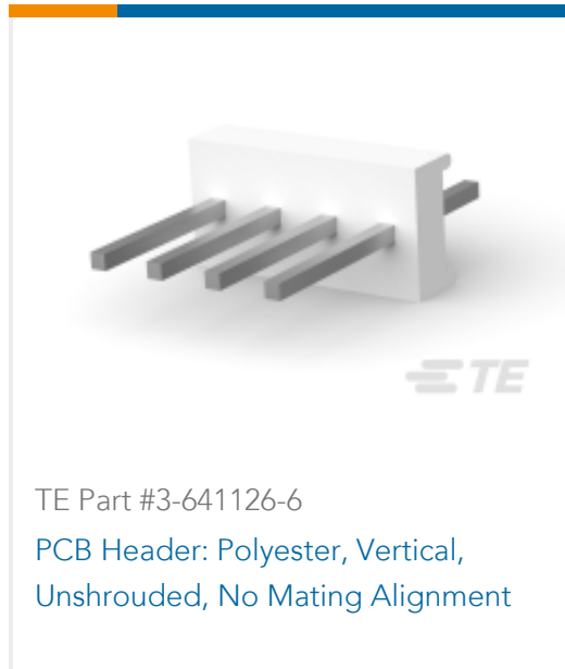
TE Part #3-641126-6 PCB Header: Polyester, Vertical, Unshrouded, No Mating Alignment