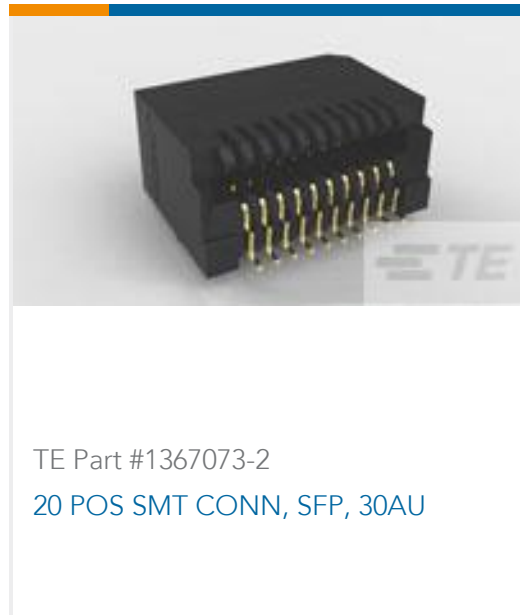
TE Part #1367073-2 20 POS SMT CONN, SFP, 30AU