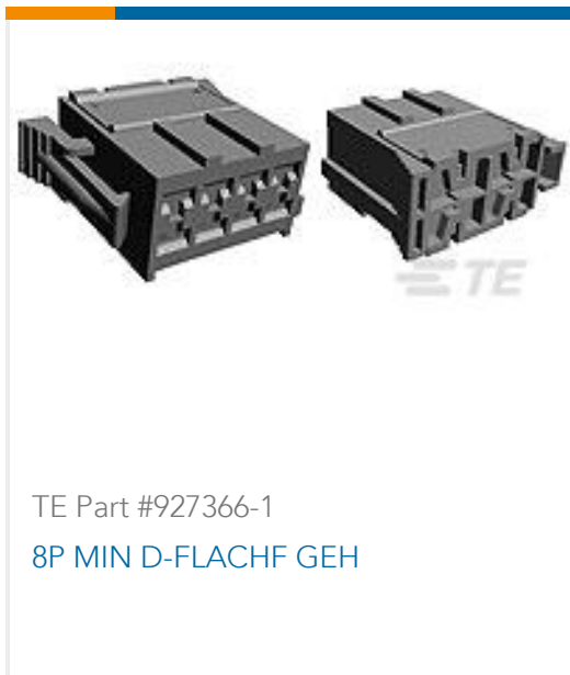
TE Part #927366-1 8P MIN D-FLACHF GEH