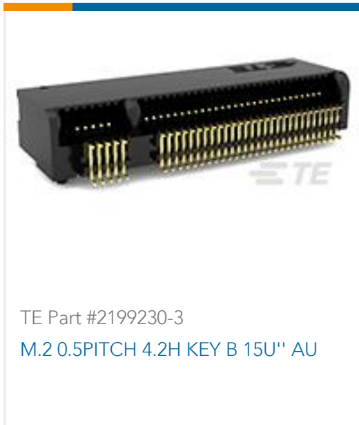
TE Part #2199230-3 M.2 0.5PITCH 4.2H KEY B 15U" AU