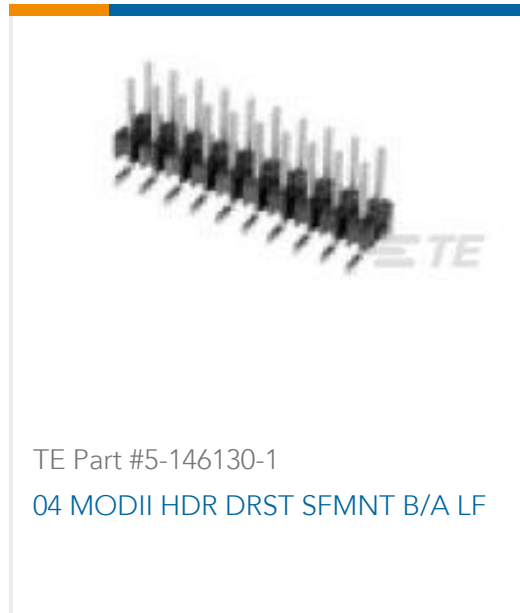
TE Part #5-146130-1 04 MODII HDR DRST SFMNT B/A LF