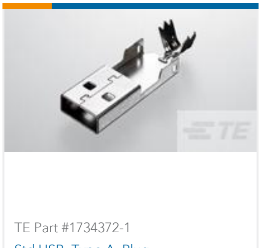
Std USB, Type A, Plug